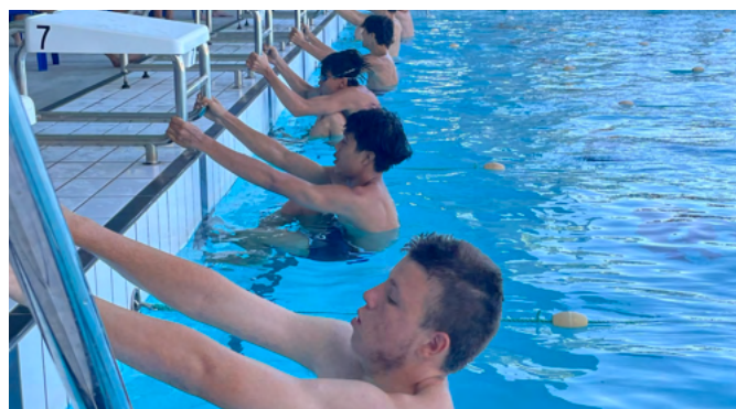
Year 10 boys ready to race