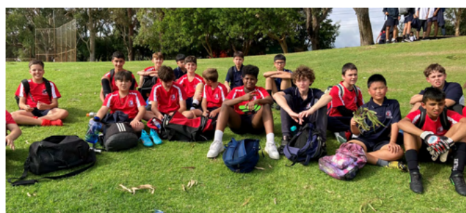
Year 8 Football team