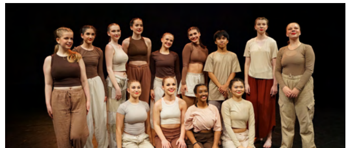
Years 11/12 - “Rescue”