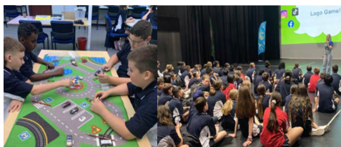
Using the map to explore services required in building a town