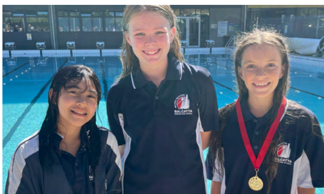
Year 7 Champion Girls