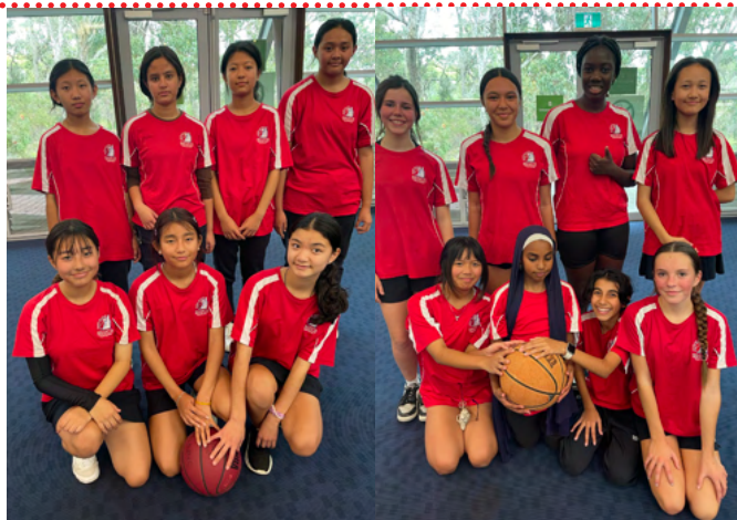
Year 7 Basketball teams

The Year 9 Lightning Carnival was held on Wednesday 7 June and the Year 10 Lightning Carnival on Tuesday 20 June. Students competed against other schools in our area. Sports included netball, basketball, volleyball, soccer, football and hockey, held at various venues.