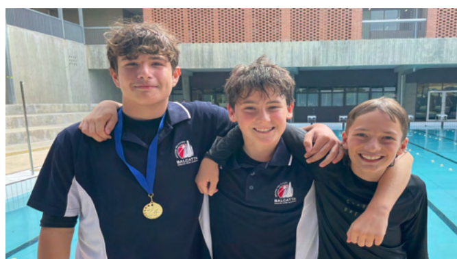
Year 8 Champion Boys