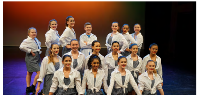
Year 7 - “Footloose”