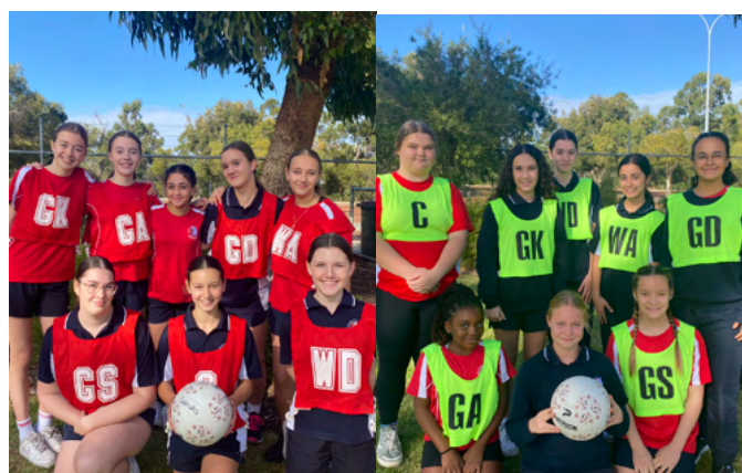
Year 8 Netball teams