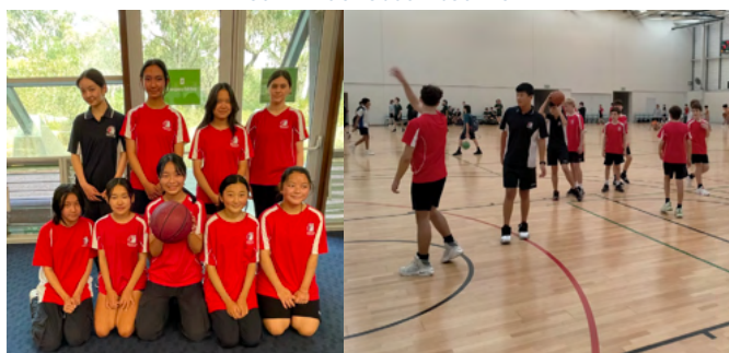
Year 8 Basketball team Year 8 Boys Basketball in action