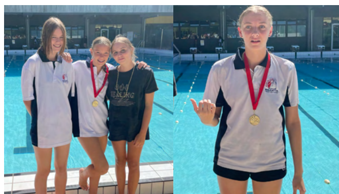
Year 10 Champion Girls