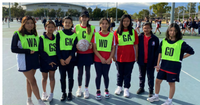
Year 7 Netball team