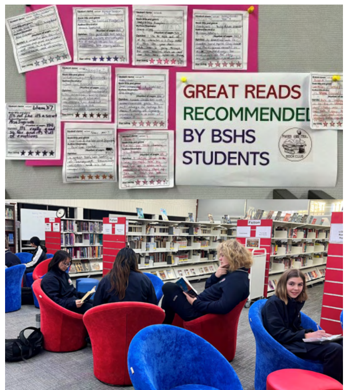
Book Club members reading in the Library