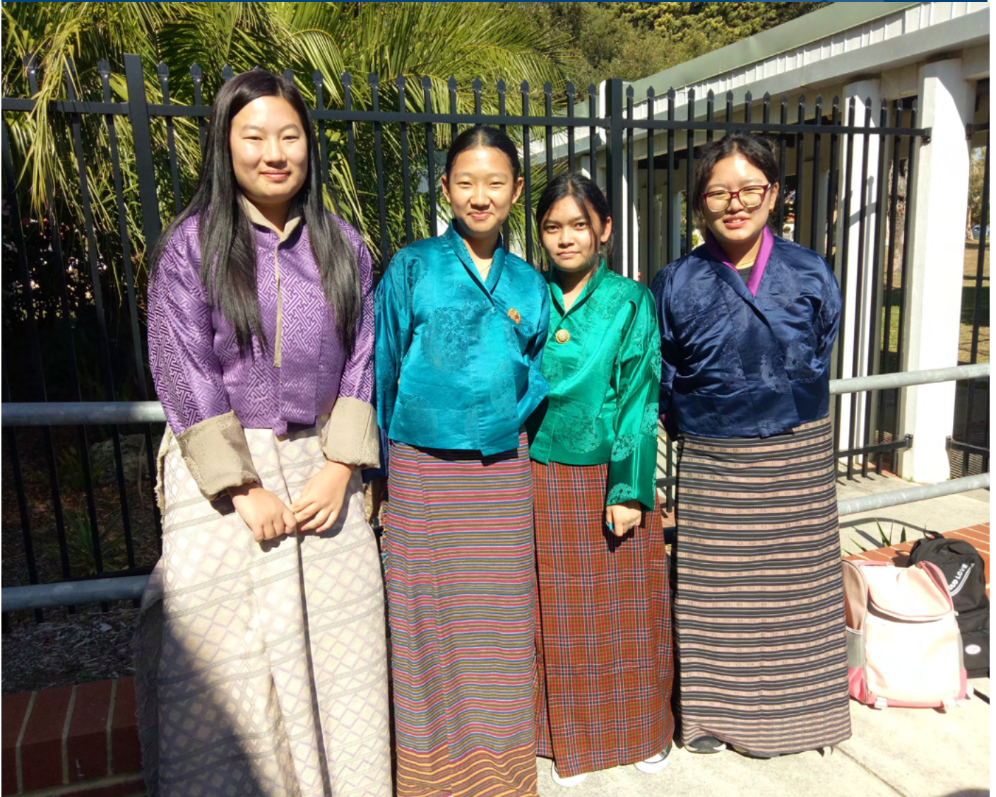
Students in traditional cultural dress for Harmony Day