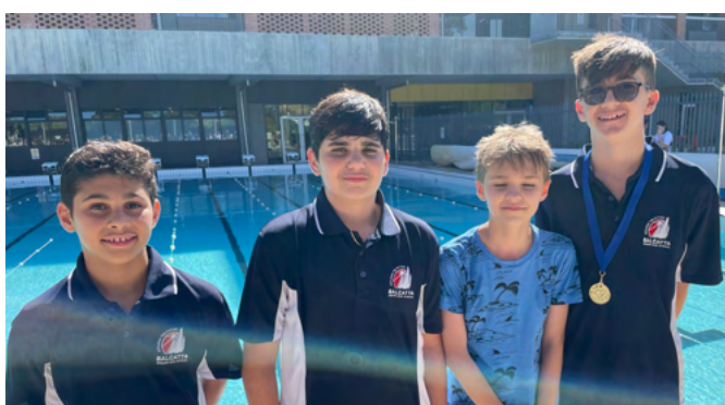
Year 7 Champion Boys