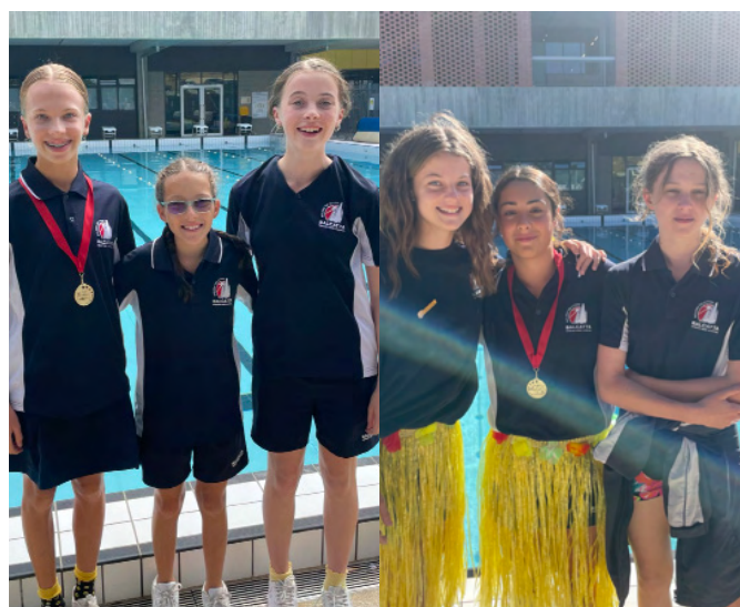
Year 8 Champion Girls