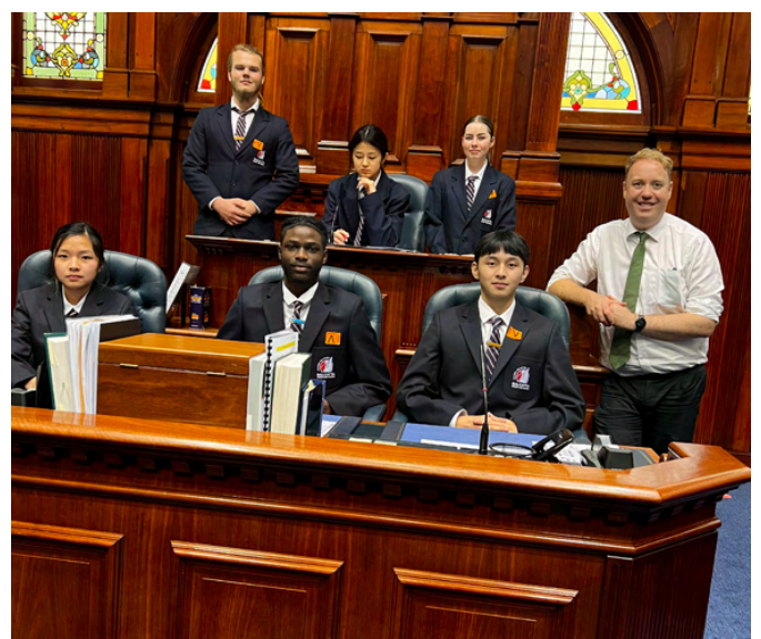
Year 12 students sitting in the Chambers at Parliament House

Front Page photo: Nexus Dance Alliance, Year 7 - "Footloose" Back Page photo: Students in their traditional cultural dress on Harmony Day