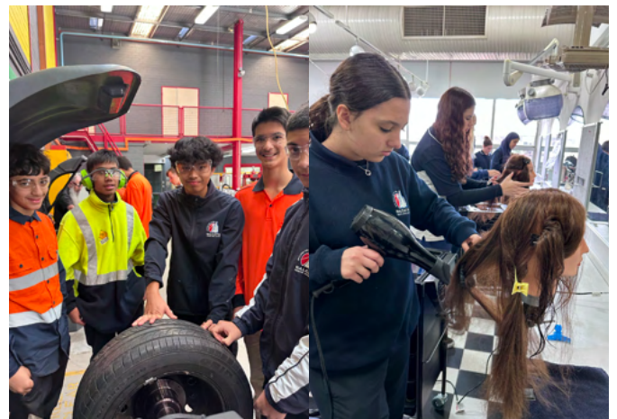
Students at the Automotive Career Taster

We look forward to continuing our efforts in providing our students with meaningful Career Taster experiences which pave the way for their bright futures.