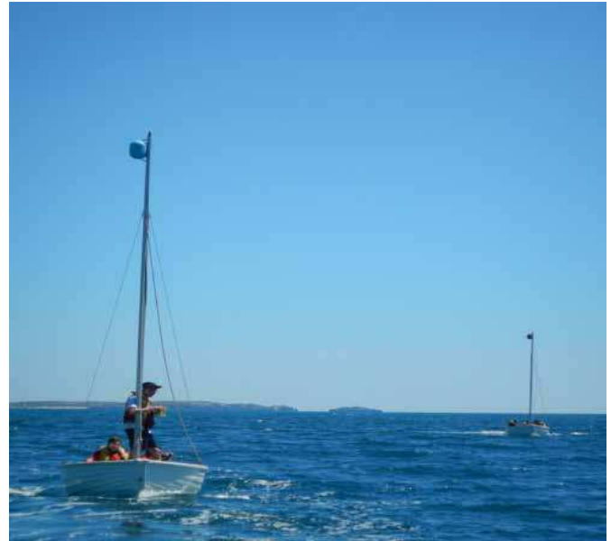
Returning to Fremantle across Cockburn Sound