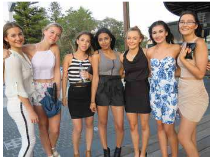
Girls just want to have fun!