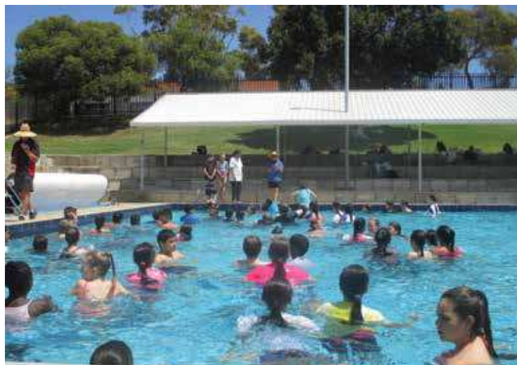
Fun in the pool