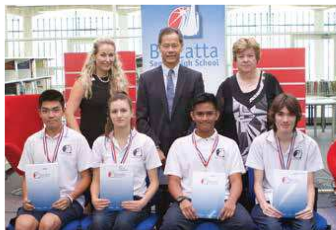
Our Top Year 11s