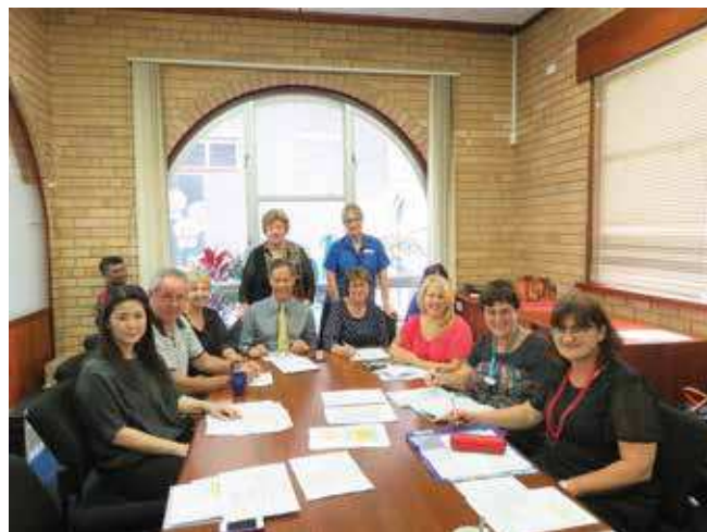
Final School Council meeting 2015

This has been a very active year for the Council who have achieved much. This could not have occurred without the energy, enthusiasm and commitment of Council members and the hard work of the Executive, teaching and support staff of the school.