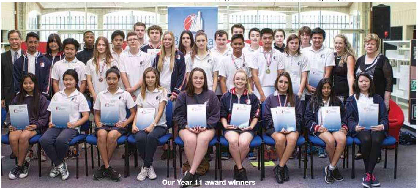
Our Year 11 award winners

In addition to the special awards many other students were the recipients of subject awards. All the students are to be congratulated for their efforts during the year.