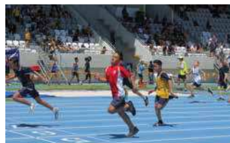
A supreme burst at the finish line