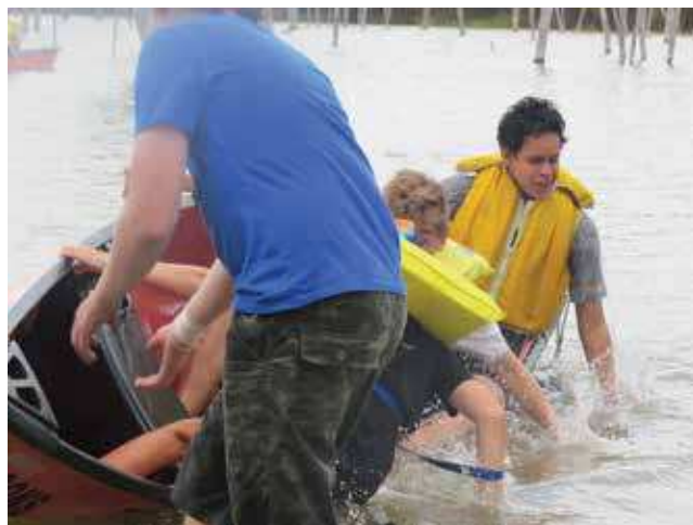
Why a water safety lesson was needed