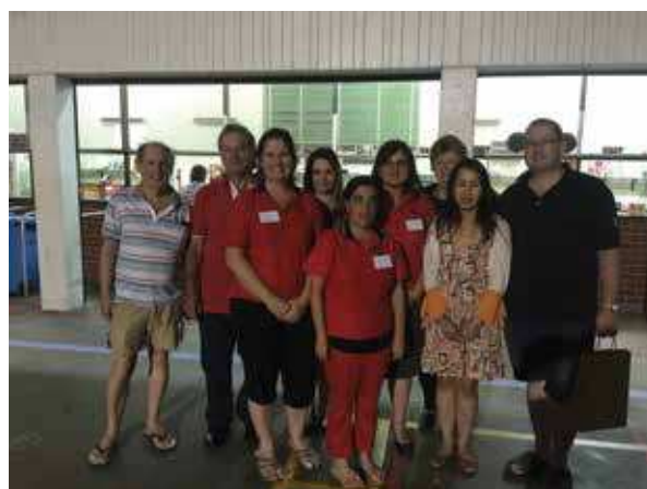
P & C volunteers at the Orientation Night