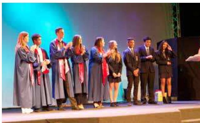
2015 & 2016 Prefects