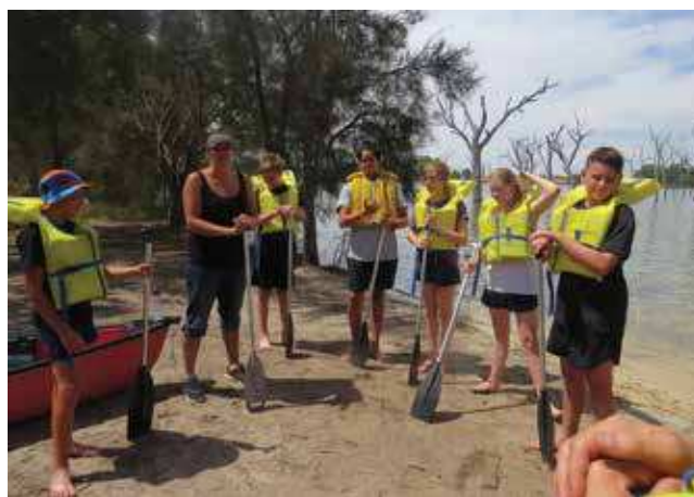
Water safety lesson

A Year 10 Outdoor Recreation End of Year Excursion was held on Wednesday December 9, 2015. In what was a culmination of the year's activities, the class set out for an action packed day. First stop was Warwick Superbowl for a game of ten pin bowling. While no lane records were broken (or even in danger), it was a good warm up for the remainder of the day. Next stop was Darklight Laser Tag in Joondalup where the students demonstrated their combat skills. After lunch at Lakeside Joondalup, the final stop was Trigg Beach for a surfing lesson. Conditions weren't the best but the group persevered to the point where no-one left without bathers full of sand.