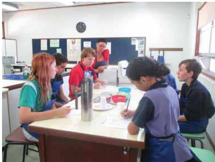
Budding chefs at work