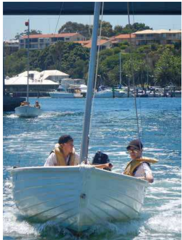
Heading downriver for the ocean