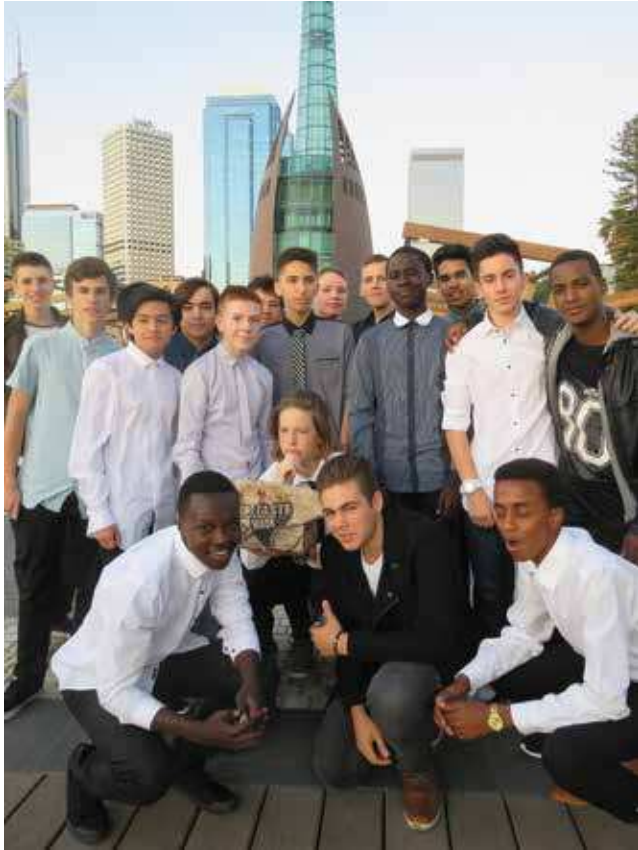
The boys looking sharp

On Tuesday 24 November, Year 10 and 11 students enjoyed a night out on the Swan River. The weather was favourable and the river provided the perfect backdrop. Students were dressed impeccably and danced the night away as we cruised from Barrack Street Jetty to Fremantle, taking in the sights and lights of the city. All had a marvellous time although some reported sore feet the next day.