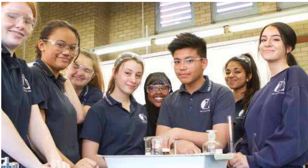
Our Year 9 Chemistry Gurus

For the first time this year, as part of the Orientation program a selected group of Year 9 students acted as Peer Tutors to the visiting Year 6 students.