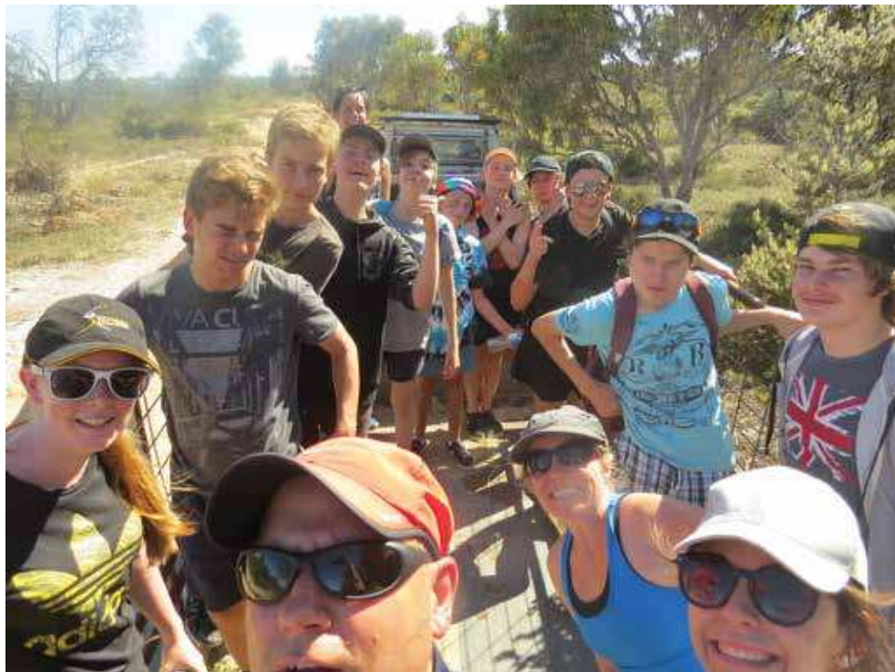
The whole group ready for action