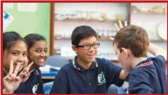
More teamwork in class