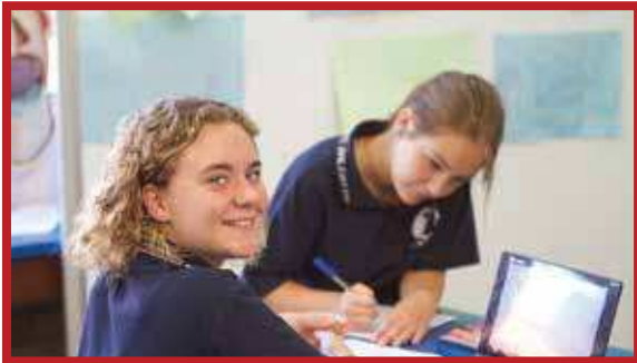
Year 8 students at work