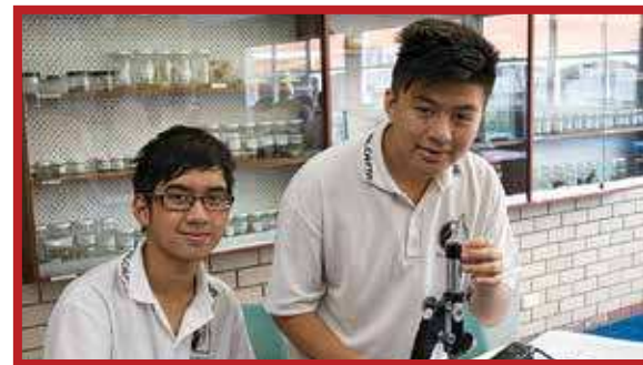
Year 11 boys at work