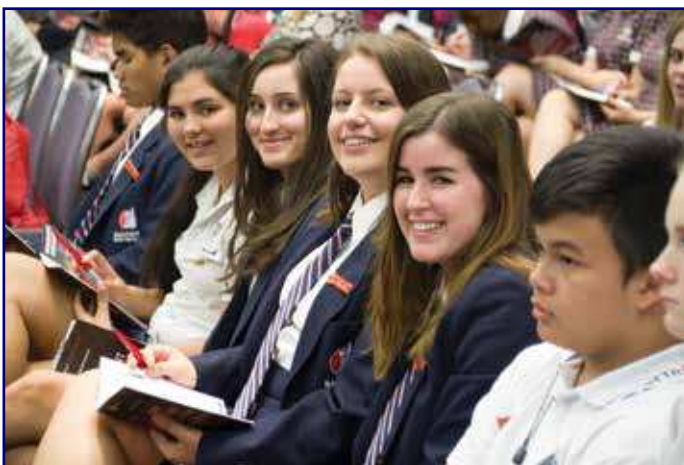
GRIP Leadership Conference