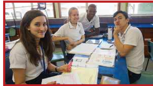
Year 12s hitting the books