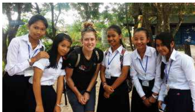
A new teacher for the day

The trip to Cambodia and Vietnam was honestly the trip of a lifetime. I think I started off my international travels on the right foot. I was not reliant on my parents for money and planning, it was left to us as a team. We have all learnt important life lessons from this. I have come out of this trip more independent and self-sufficient, knowing how to get around, find accommodation and source food. This puts us 10 steps ahead of most other teens. We have seen sides of these countries that people don't usually see on a normal capital city tour. We saw the more realistic sides of both countries on our adventures through the jungle and were able to help local schools. It was a trip that I will always remember and treasure.