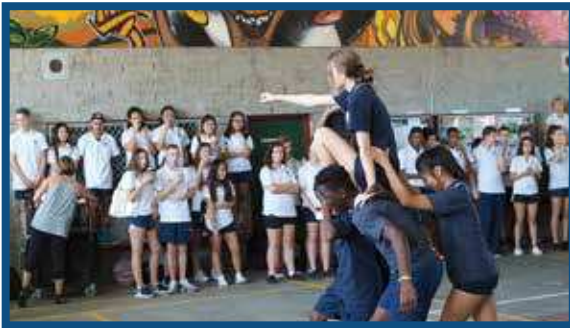
Dance Flash Mob - recess surprise