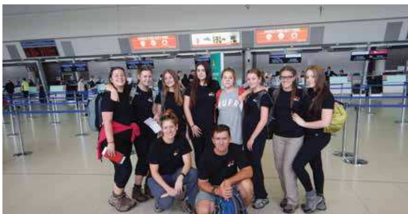
Embarking on their great adventure