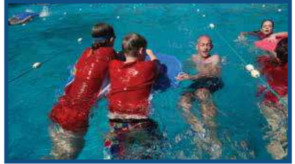
Year 9 carnival fun