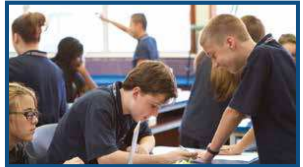
Year 8 - working as a team