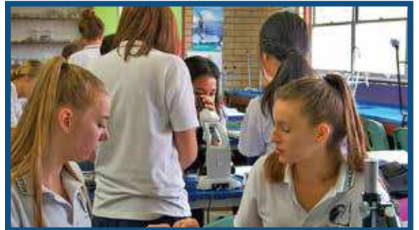
Year 11 girls at work