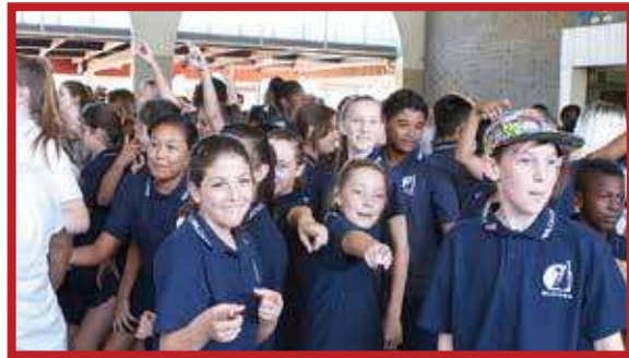
Part of the Flash Mob at recess