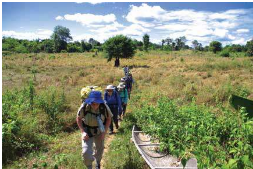
A long hot trek

World Challenge was definitely a challenge. It taught us all different things. For me the trek was my main challenge. Having a heavy pack on my back was very hard. The highlight of the expedition was finishing the trek. It was a proud moment and gave me a lot of self-belief knowing if I put my mind to something I can achieve it.