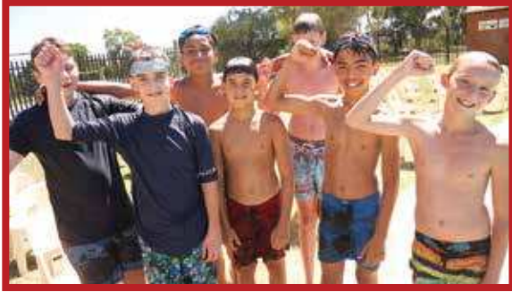
Our Year 7 boys at their carnival