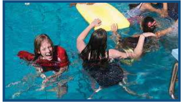
Great fun at Year 9 carnival