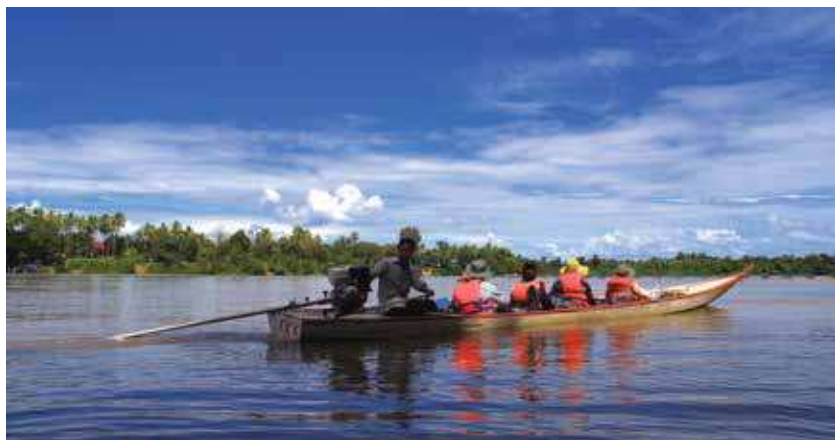
Varied means of transport