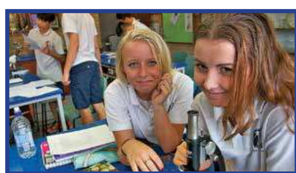
Year 11 girls working with microscope