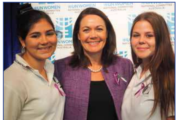
With Police Minister Hon. Liza Harvey