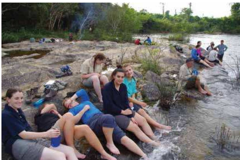
A welcome rest break