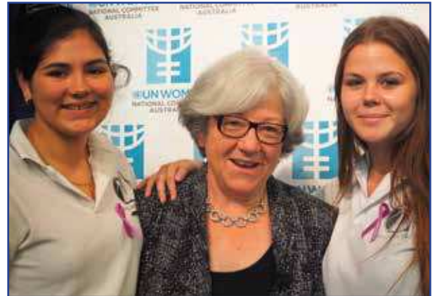
With Ex-Premier Carmen Lawrence