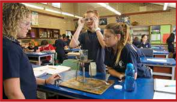
Year 8 scientists at work