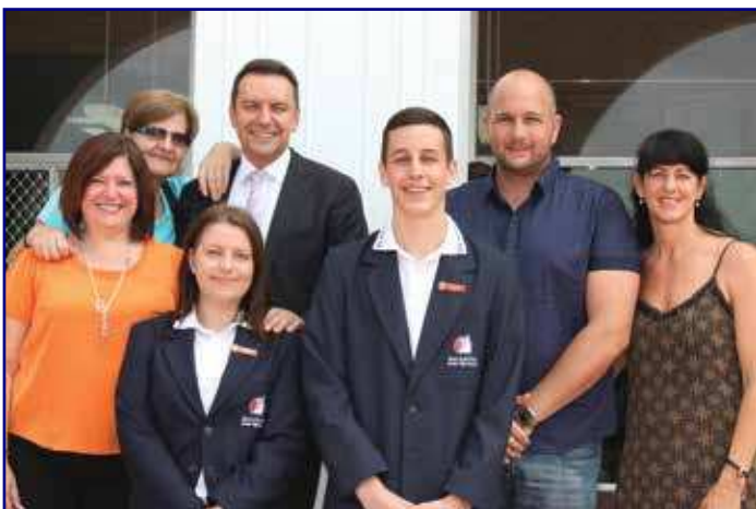
Prefects with their families