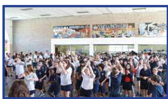
Another Dance Flash Mob