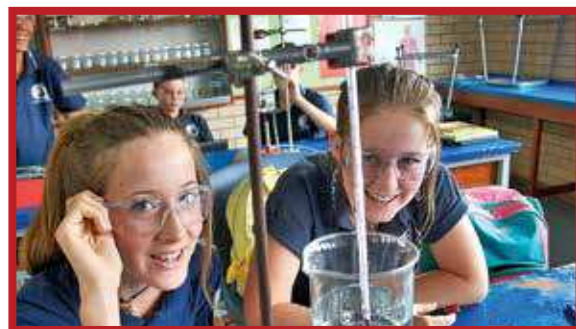
Year 8 scientists