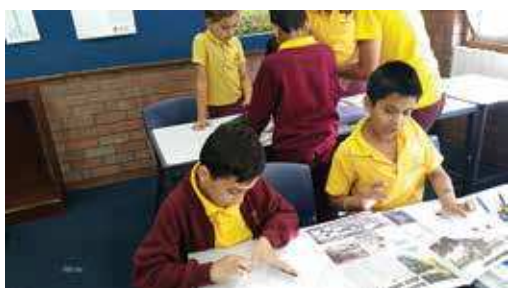
Osborne Primary students engaged in forensics

We recently had a visit from Osborne Primary School's Year 6 class to attend the first of a four week program in Forensic Science. The students were introduced to the science involved in human fingerprinting. They had the opportunity to take a set of their own fingerprints and then identify their unique patterns. The inquisitive students had such a thirst for knowledge in this area and provided staff with an endless supply of questions. These new fingerprinting skills were later used to make a personalised laminated bookmark using their own unique print.