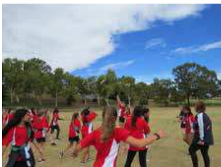
Ultimate frisbee game