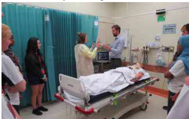
Students learning about trauma room processes