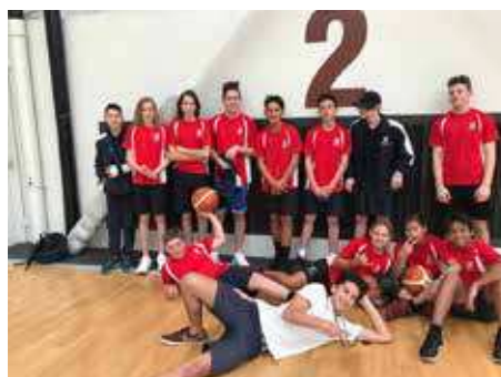
Year 8 boys basketball team