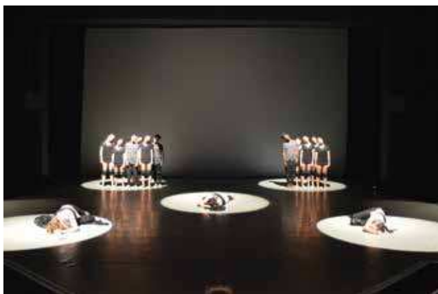
'Incubus' performed by Years 11 and 12 students