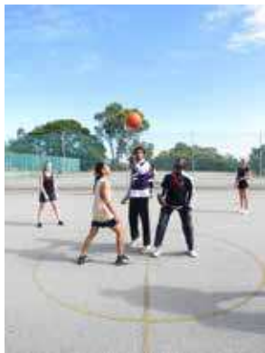
Certificate ii students coaching basketball

During Term 2, Year 7 students have enjoyed their introduction to high school experiencing a number of activities ranging from Ultimate Frisbee to Gymnastics.