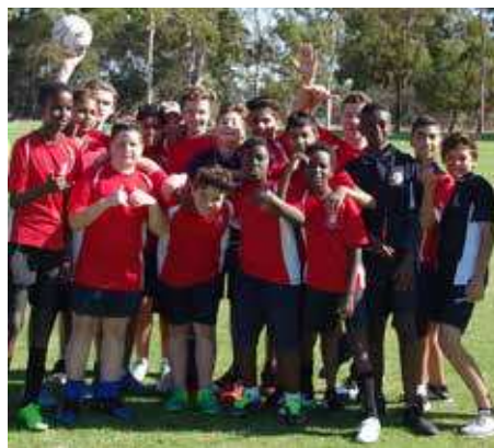
Year 8 boys soccer team