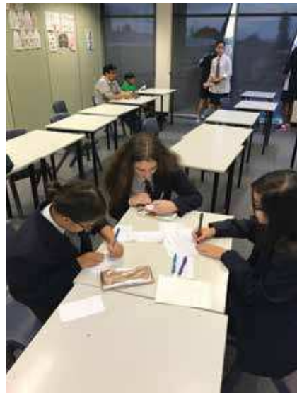
Novice Team 1 preparing their debates