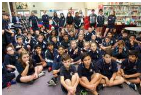
Years 7/8 Science students and Takari Primary School students asking questions