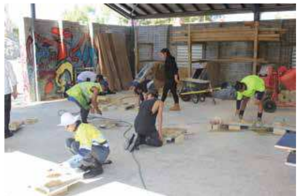
Bricklaying students working in the shed