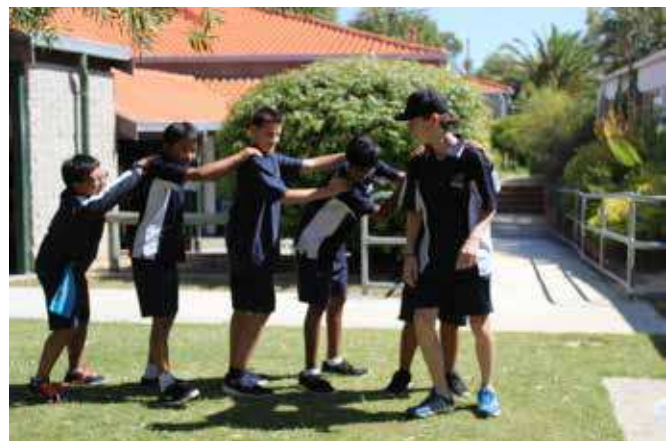
Year 7 students 'following the leader'