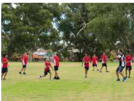
Enjoying a game of frisbee