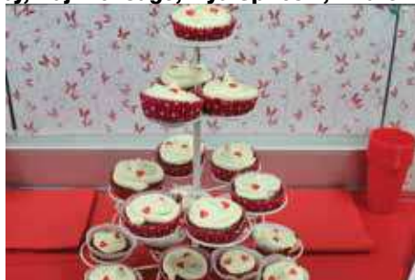
Red velvet cupcakes