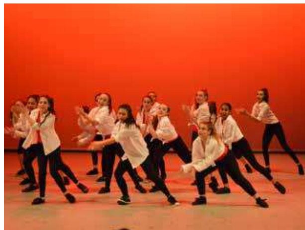
'Demon Fighters' by Year 7 dancers