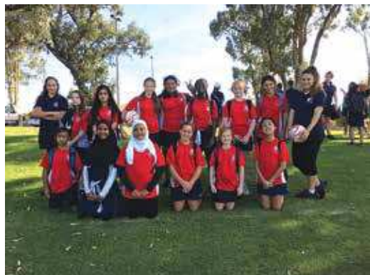
Year 7 Girls Soccer team

Older students volunteered to umpire and coach teams throughout the day. This was a great learning experience and helped with developing their interpersonal and self-management skills. It was pleasing to receive positive feedback from members of the community and other schools about the way the students from Balcatta Senior High School represented the school and themselves at the carnivals. Thank you to all the teachers for supervising the students in a variety of weather conditions. Without their assistance, events of this nature would not be able to go ahead.