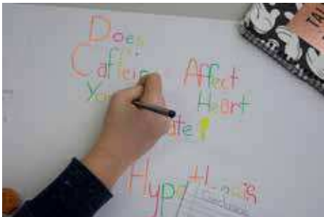
Science project: 'Does caffeine affect heart rate?'