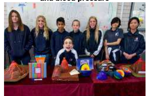
Interested Year 8/9 students displaying projects on 'Earth Science'