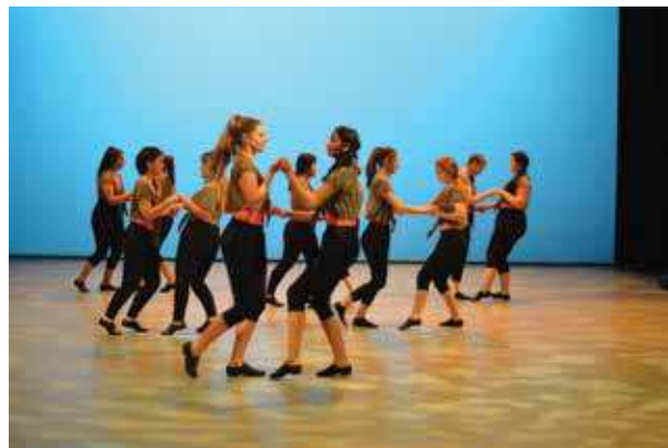
'Oh Snap' performed by Year 10s