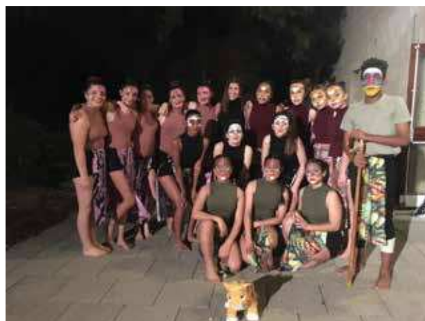
'He Lives In You' dance group