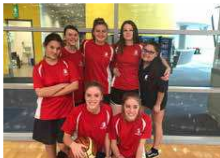
Year 9 Girls Basketball team