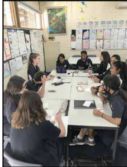
Debating teams in practice