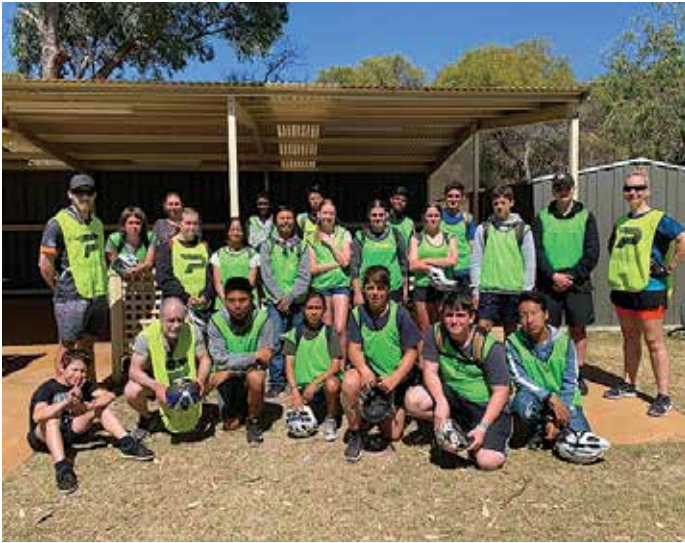
Year 9 Outdoor Recreation class