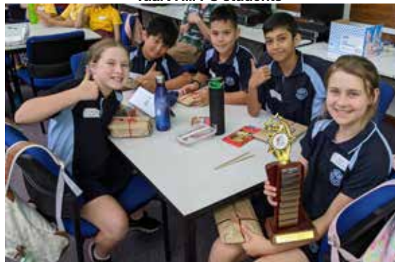
Winners - Takari Team 2