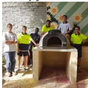
The pizza oven is now ready for baking