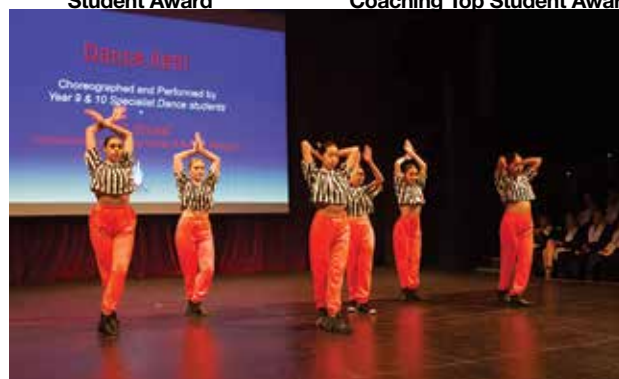
Year 9 and 10 dance students performing '16 Shots'