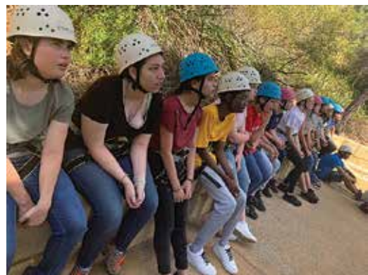
Waiting in anticipation to abseil