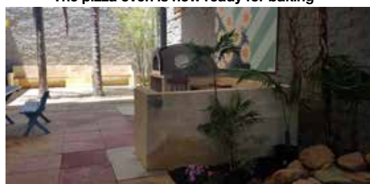
The final result