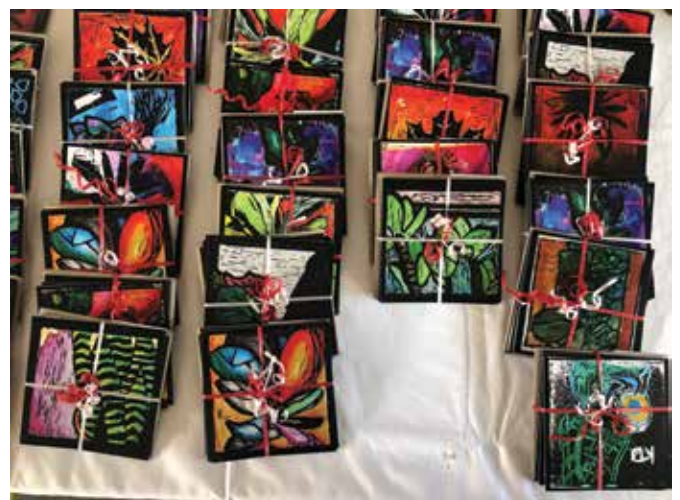
Cards for sale, designed by Year 7 students