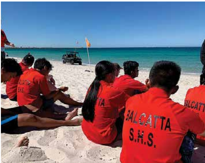
Ready for beach games

As part of the presentation some students participated in an experiment where they wore glasses (of differing strengths) which altered their vision and balance to show how intoxicated they were after having several standard drinks. Students had to walk in a straight line and then 'hi-five' the presenter when they got to the end. Students found it entertaining when they saw their friends were unable to walk straight and missed the presenter when trying to 'hi-five'. This was a great example for them to see how the body changes when drinking alcohol.