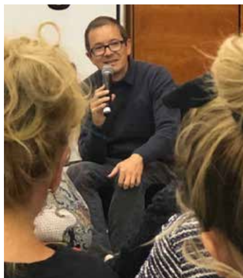
Shaun Tan 'In Conversation' with the audience