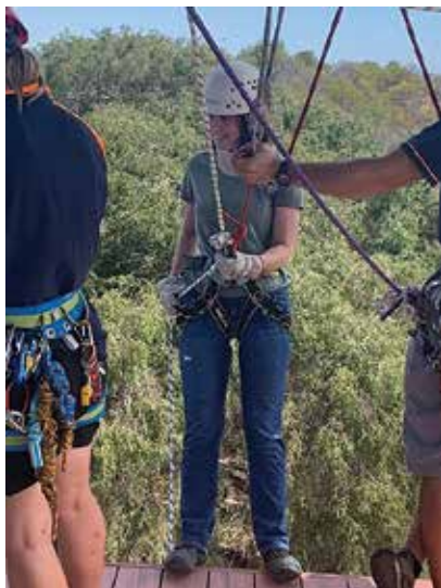
Ready to abseil