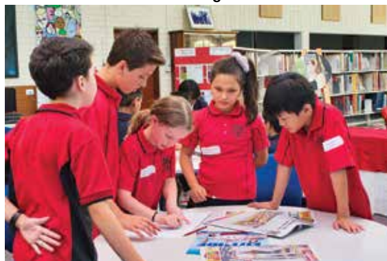
Tuart Hill PS students