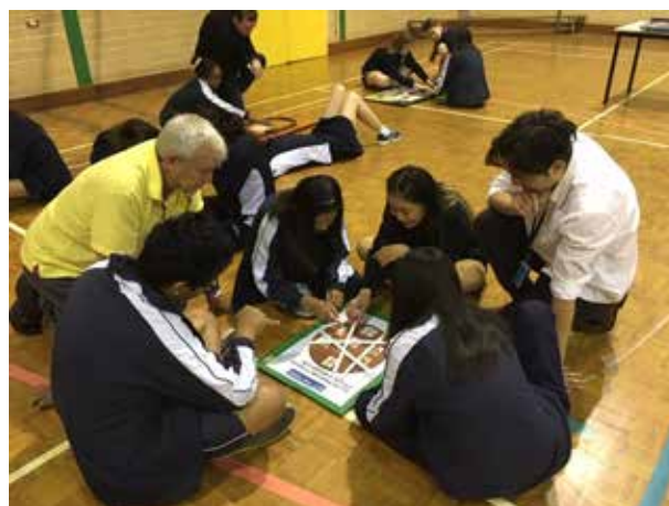
Students developing their problem-solving skills