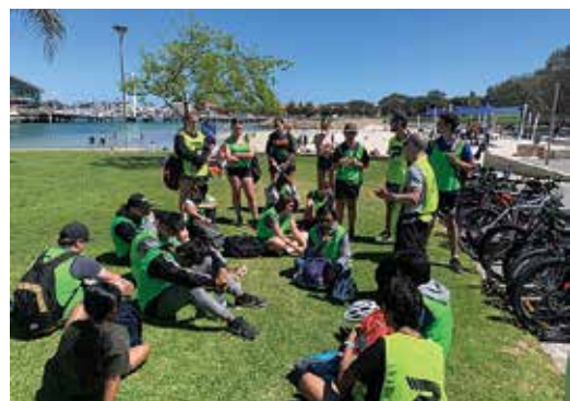
Having a rest, ready to set off again on their bikes