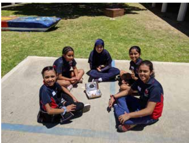
Balcatta PS students eating lunch