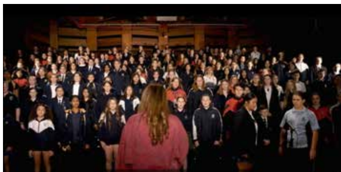
Ms Sprogowski conducting the choir

'World of Maths' is very enjoyable and makes students want to think. It helps develop skills necessary to work in small groups as an effective way of learning mathematics, and allows students to interact, which can boost confidence and promote positive attitudes towards mathematics. The students found the various activities enjoyable and they were very engaged.