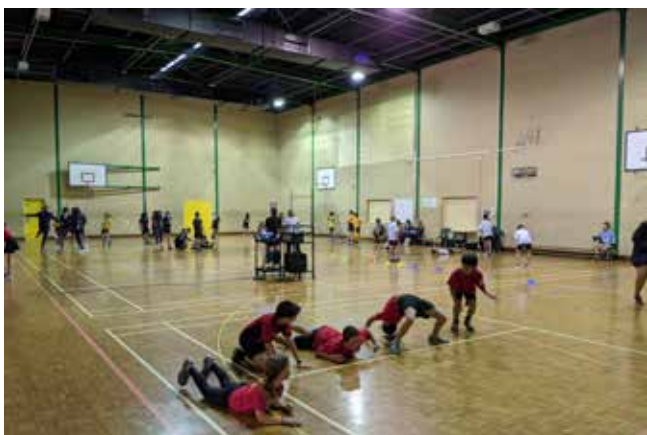
Physical Education lesson for primary school students