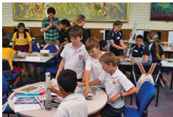
Students building their towers

Two teams of five Year 5 students from each primary school participated in the Academic Challenge and will also receive an invitation to apply for the 2021 intake of the Academic Extension program. Students competed in four challenges that spanned across all learning areas. For each challenge, students earned 'points' – Takari 2 earned the most points at the end of the day and was presented with a perpetual trophy for the Balcatta Academic Challenge. Prizes were also awarded throughout the day for students and teams who demonstrated excellent team work, critical thinking and problem-solving skills.