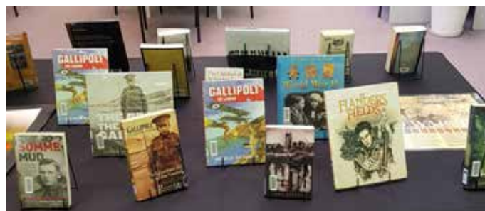
Books about World War I