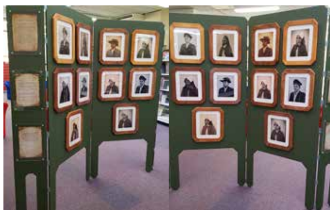
Letters created by students regarding perspectives of the war and self-portraits manipulated to look authentic

The result was a fantastic compilation of students' work.