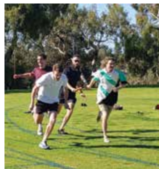
Teachers join in the relay race