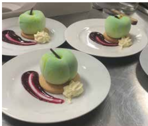
Apple Pie made with icecream and apple centre

As part of their assessment, Ms Malcolm's Year 12 Certificate II in Hospitality students turned their classroom into a pop-up restaurant called 'Bloom' during Week 7 and Week 8. They served a spring-inspired menu with a main course choice of grilled chicken breast or lamb kofta and for dessert, a choice of apple pie or chocolate mousse. Students acted as waitresses and served their peers and teachers who were their customers. The quality of food produced by the students was amazing and they should be proud of the effort they put into this task.