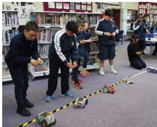
Students preparing for their race

It was enjoyable seeing the students obtain success by designing and constructing their own models. When asked what the students had learnt, one student responded "never give up". His team had been doubtful about their creation's ability. They still entered the race and went on to obtain a place in one of the two races.