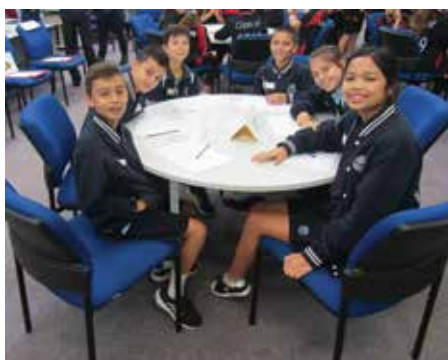
Takari A team