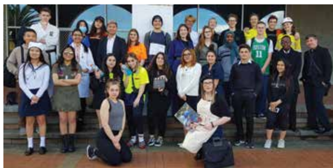
Year 12 students representing many career paths

Some of our Year 12 students dressed up for future careers day! We had two artists, barista, dancer, several doctors, film director and media entrepreneur, martial arts instructor, miner, musician, air force officer, navy officer, two nurses, programmer, several tradies and a yoga teacher!