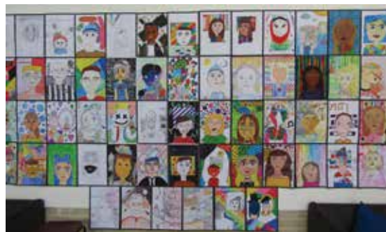
Artwork by West Balcatta Primary School