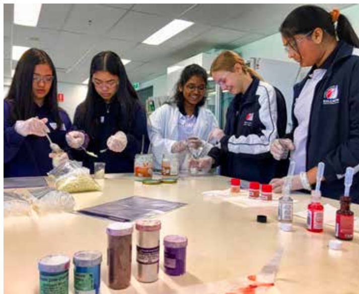
Students making their own cosmetics