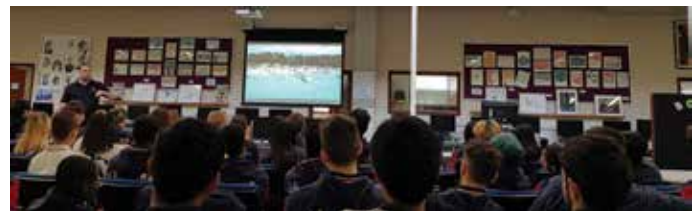
'Red Frogs' presentation to Year 12 students

On Tuesday 3 September, our Year 12 students were presented with information about the Red Frogs Leavers' support program. Red Frogs educates young people on safe partying behaviour and promotes alcohol-free and/or diversionary activities that engage young people in certain environments. Red Frogs is a youth support network with thousands of volunteers who support young people from the ages of 13 to 30. They are present at all major school leavers' functions, music concerts and sporting events across Australia. Our students were informed about drug and alcohol free events in the iconic Leavers Zone Dunsborough and Meelup Beach in the South West. Red Frog volunteers not only support school leavers, they also cook pancake breakfasts and host BBQs, clean rooms, hang out with Leavers and help in situations that require mediation and referral.