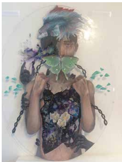
'Boys Can't be Abused' by Meg Bradsell