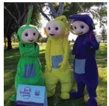
Teletubbies minus one