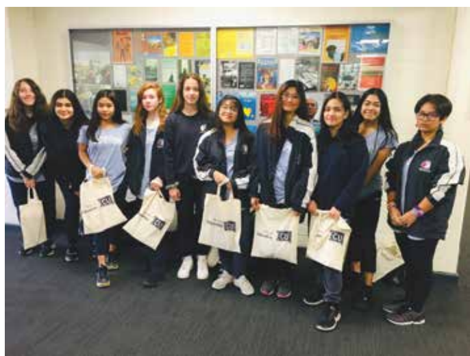
Year 9 students at excursion

On Tuesday 2 July, the Mathematical Association of WA and Edith Cowan University organised a 'Maths Empowering Girls' Day for Year 9 girls across the metropolitan area. This event aimed to empower girls to recognise and take up some amazing opportunities that studying higher level maths can present for them. It offered an exciting program of inspirational speakers and hands-on maths activities as well as the opportunity to speak to a range of professionals to hear how maths has empowered their own careers. Eleven of our students attended this event and found it very enjoyable. Their aim was to inspire more girls to choose higher level maths and to develop the skills to understand how maths and mathematical thinking impacts their careers and everyday life.