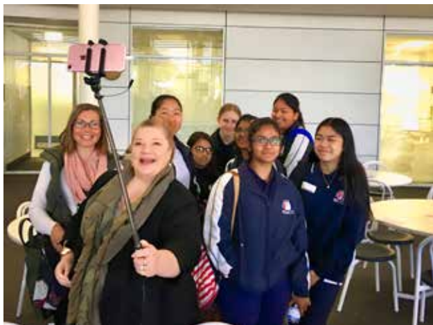
Minister for Education Hon. Sue Ellery takes a 'selfie'