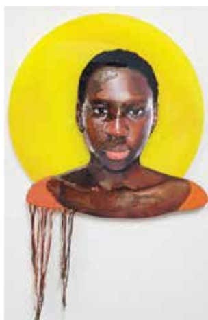
Artwork titled 'Rise of a New Light'