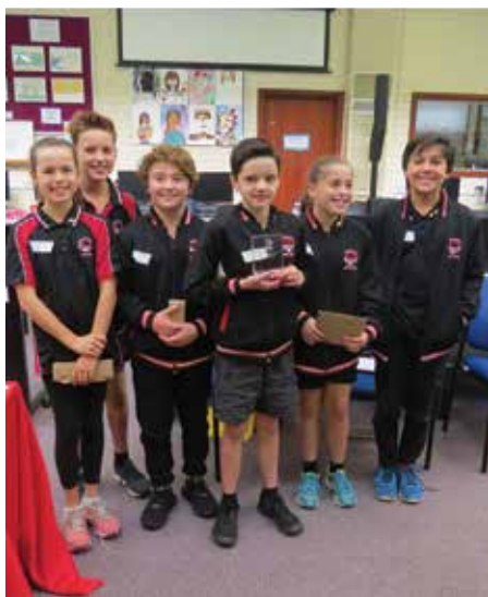
Winning team - West Balcatta A