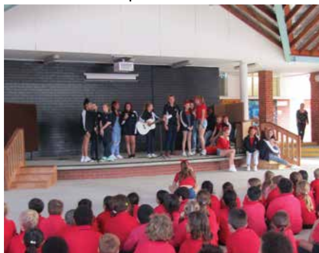
Year 7 and 8 Arts Roadshow performers