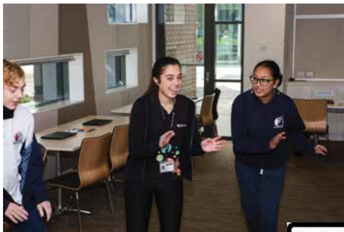
Balcatta SHS STEM students practising their dance routine, combining science and art

Curtin University invited three schools, with only five dancers and five ICT/coding students from each school to attend. Workshop participants were able to engage and interact in activities that spark creativity and fun. They were able to create pressure sensors that triggered lights to flash when pressed. They also learnt and created a dance routine using pressure sensors. Participants were inspired to explore the ways that science and technology enhance the arts.