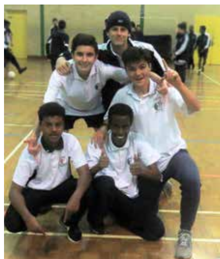
Year 11 and 12 Soccer winning team

Our Year 11 and Year 12 Form indoor soccer tournament finished on 16 August, after three weeks of competition. It was an all Year 11 grand final with 11.3 taking the title with a 2-0 victory over 11.4.