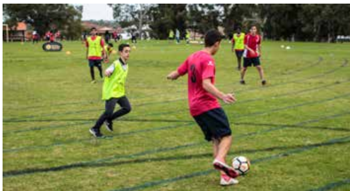
Chelsea Foundation Club Soccer Workshop