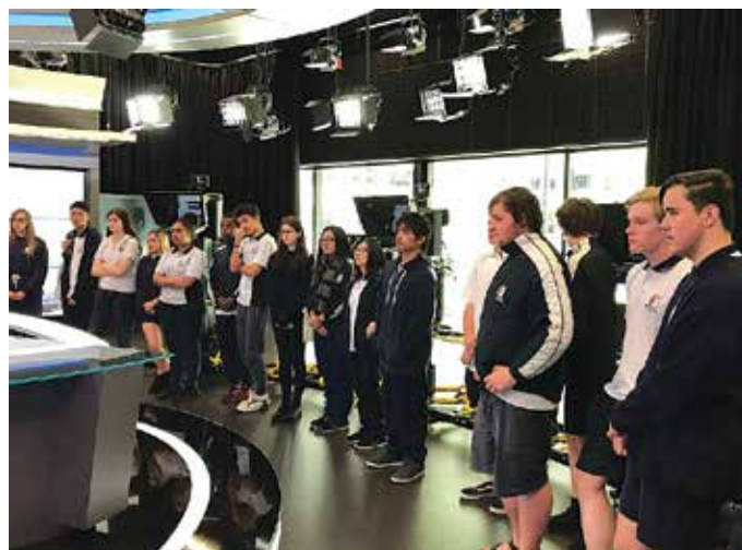
Year 11 ATAR students intrigued by Channel 9 Tour