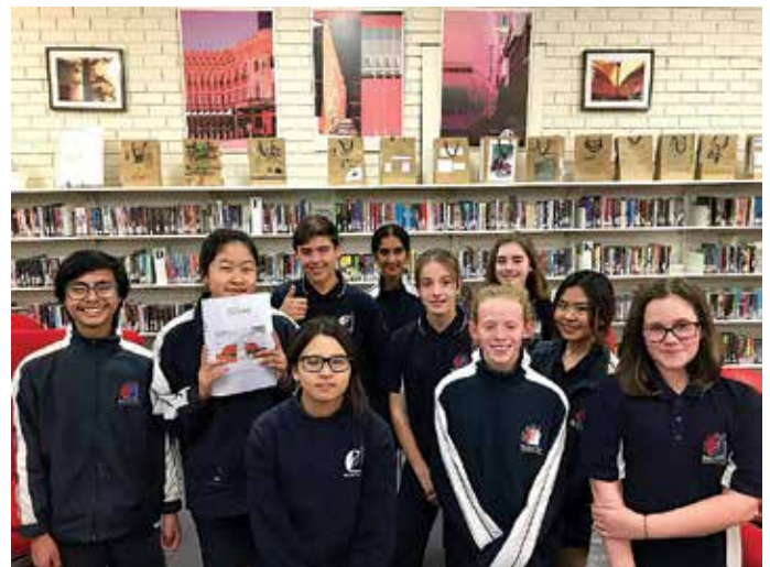
Group photo of the Write a Book in a Day students

Funds raised through sponsorship go to The Kids' Cancer Project, a national charity with a mission to support scientific research to help children with cancer.