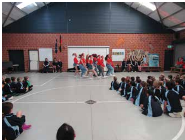
Year 8 Special Dance students

All performers should be very proud of their efforts and we can't wait for the next one.