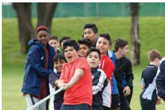
Striving to win