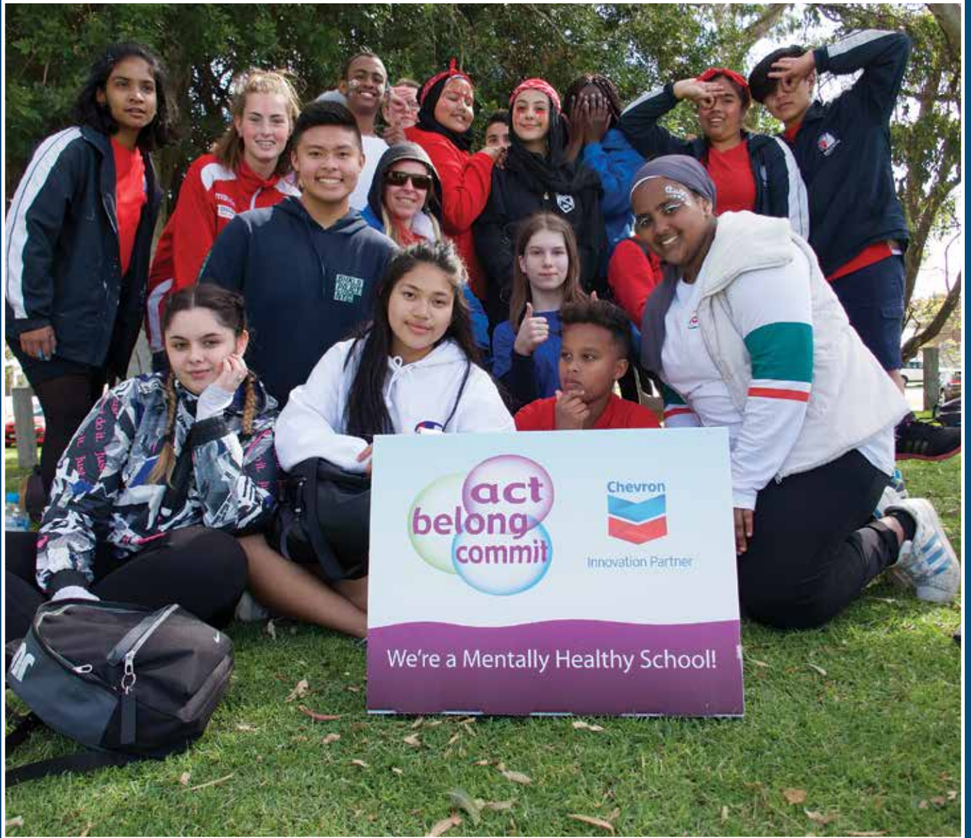
Balcatta Senior High School students at the Whole School Athletics Carnival