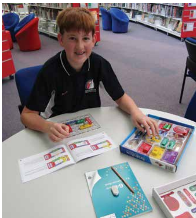
Electronics Club student preparing to make his Flying Machine