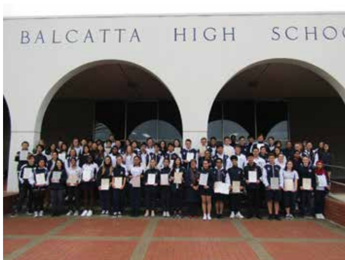
Year 10, 11 and 12 Semester One Award recipients