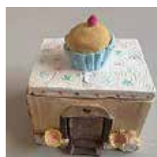
Georgia Pope - Gingerbread House

This year's exhibition included 67 artists from 30 schools. There were some great art works exhibited.