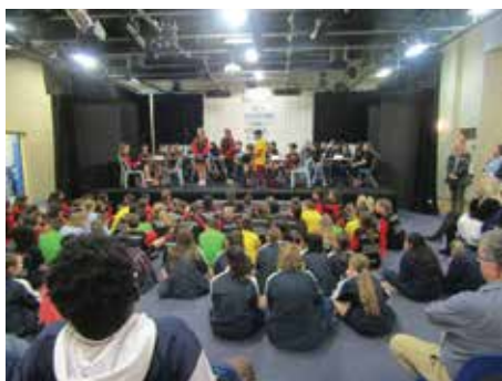
Year 6 & 7 students enjoying the Spelling Bee