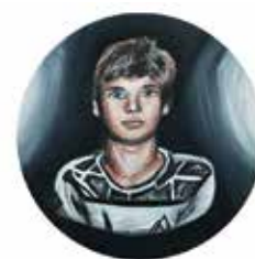
Outside the Square