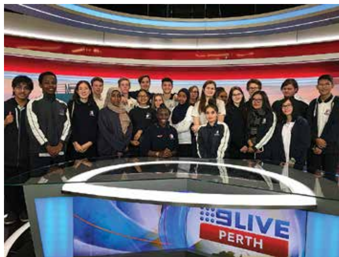
Group photo from Year 11 ATAR English Excursion behind the Channel 9 desk