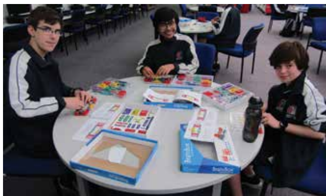
Group of Electronics Club members creating their Flying Machines