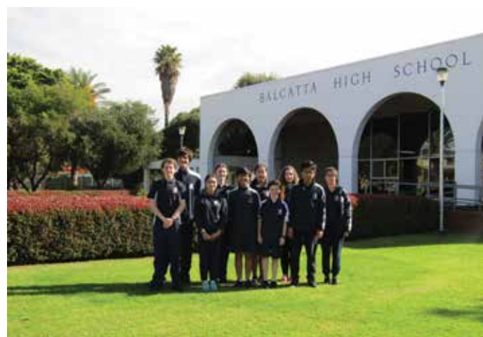
ICAS Award winners at the front of Balcatta SHS