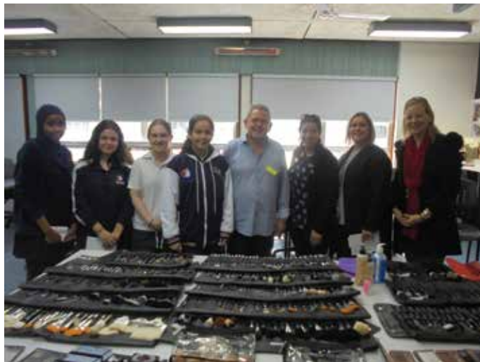
Certificate II in Retail Cosmetics students and staff

On Thursday 23 August 2018, the Certificate II in Retail Cosmetics students and staff participated in a one hour workshop presented by Crown Brushes. The workshop was held at the Balcatta Beauty Training Clinic and the focus was on make-up brushes. The workshop offered valuable industry information and was thoroughly enjoyed by all involved.