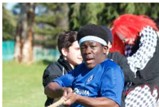
Tug of War