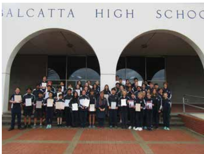
Year 7, 8 and 9 Semester One Award recipients

On Friday 20 July 2018 we celebrated the achievements of many of our students at the Semester One Awards Assembly. Students from Year 7 to Year 12 were recognised for achieving the status of Top Student or Merit Student in each learning area, as well as the prestigious "Respect Unite Excel" award, which encompasses Balcatta Senior High School's values.