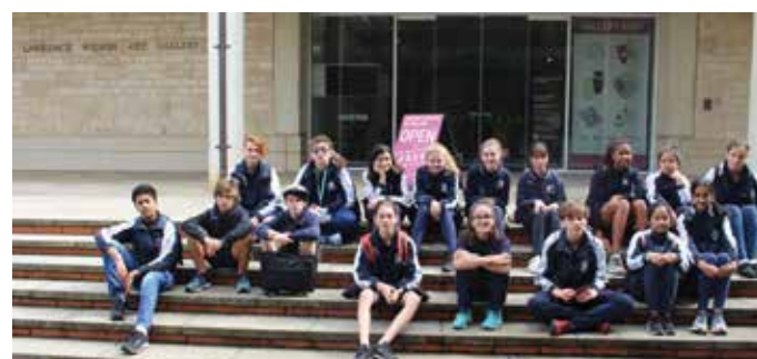
GAT Visual Art students in front of The Lawrence Wilson Art Gallery

Our Gifted and Talented Visual Art students attended the University of Western Australia on 17 August to view and analyse artwork at the Lawrence Wilson Art Gallery.