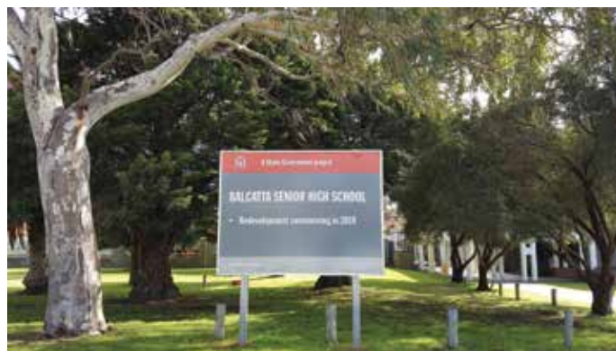
Exciting times ahead for our school