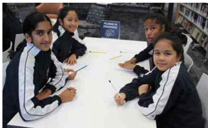
GAT Visual Art students participating in Children's Book Week