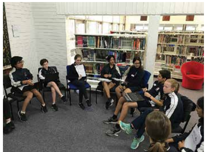
Write a Book in a Day students brain-storming their ideas