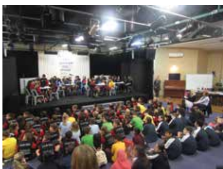
Spelling Bee in action

Thank you to all school staff and students from our local intake schools, as well as Balcatta Senior High School, for making our Inaugural Spelling Bee such an enjoyable and memorable experience.