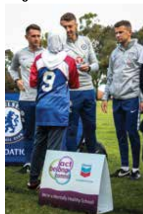
Chelsea Foundation Club member presenting to Balcatta SHS soccer students see page 3