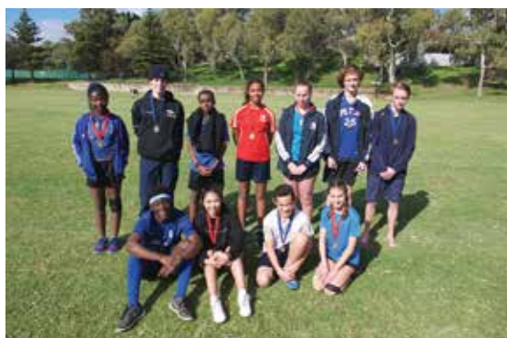
Our Champion Athletes