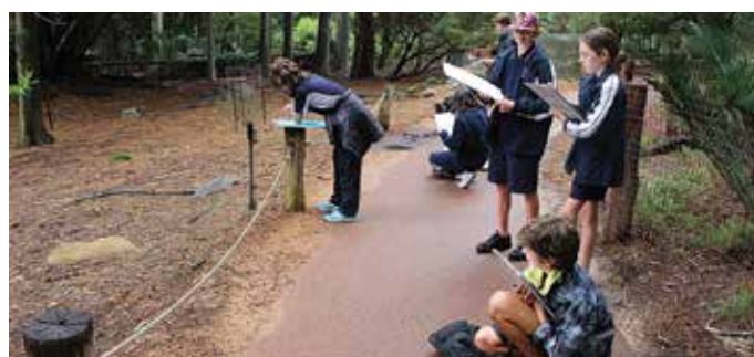
GAT Visual Art students sketching at the Zoo

The Year 7 Gifted and Talented Visual Art students attended an excursion to the zoo. They were able to take lots of photos and some quick sketches of the moving animals.