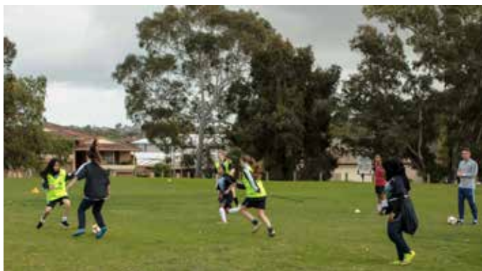
Chelsea Foundation Club Coach working with Balcatta SHS soccer students