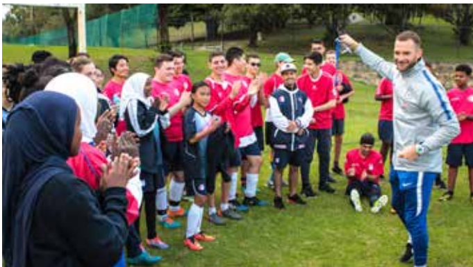
Chelsea Foundation Club member presenting to Balcatta SHS soccer students

Chelsea only visited two schools in Western Australia and our school was one of them.