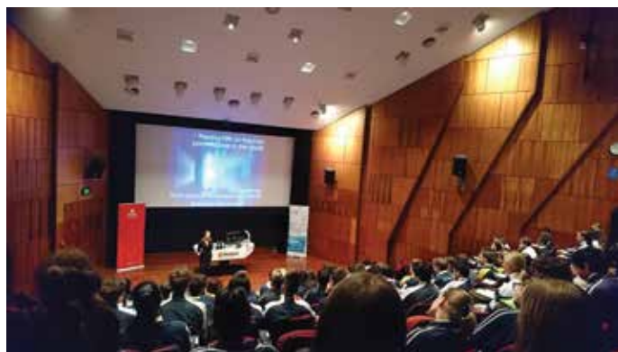
Year 11 and 12 ATAR Physics students at Murdoch University