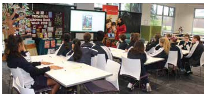
GAT Visual Art students at Children's Book Week at Osborne Park Library