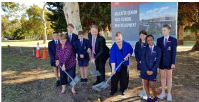
'Sod Turning' event

The upgrade and refurbishment commenced in Term 2 and the demolition of parts of the school buildings has already occurred. M block, the Performing Arts Centre and exterior rooms near the Gym have been demolished. PS Structures, a local company with much experience in building projects of this kind, has the contract for the rebuild. During the rebuild some classes have been relocated and parts of the school have been fenced off and will be out of bounds to students. The Principal's Update, Bulletin and News section on the school's website will keep you updated on the progress of the works during the year. There has been much interest from the community and the local intake primary schools. We look forward to the exciting new and modern facilities that will be available on completion.