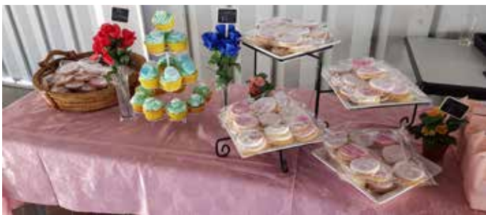
Baked goods available at the Mothers' Day Bake Sale