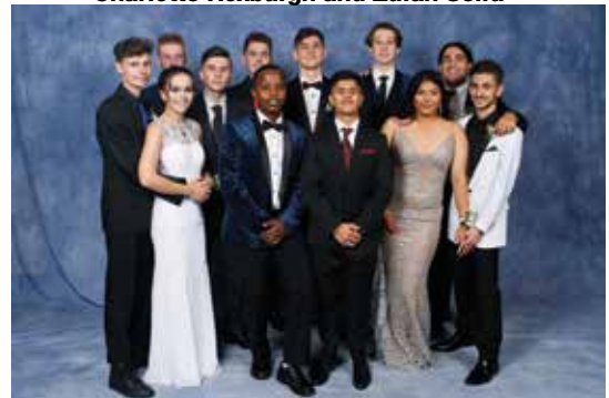
Year 12 students