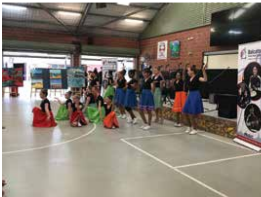
Year 7 Dance Performers