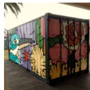
The end result!