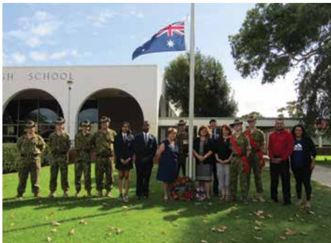
ANZAC Ceremony guests