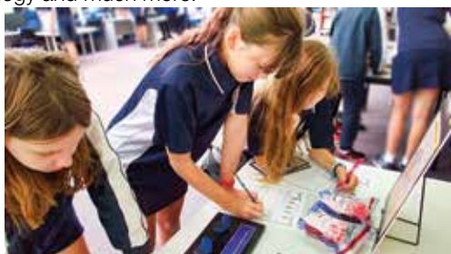
Future Forensic Scientists

The students investigated a case which explored the importance of cyber safety with social networks, the dangers of drink spiking and the consequences of taking risks. Who did Sally meet at the beach and how did she die? A 17-year-old schoolgirl is found lying dead on the ground in a disused military bunker. The girl's parents reported her missing four days prior when she failed to return home from school. There are signs of a struggle and a substantial wound to the head which appeared to be the cause of death. Students examined the crime scene and analysed the evidence including entomology, trace evidence, fingerprints, toxicology and much more.