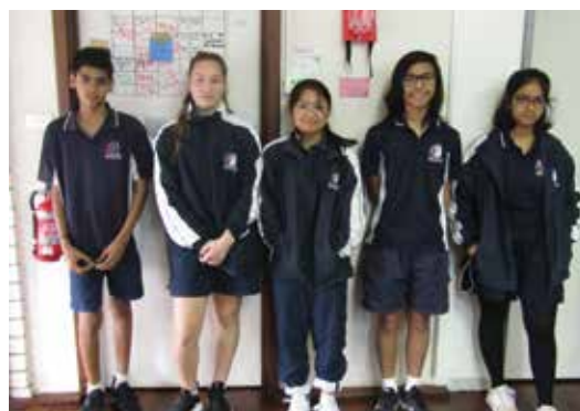
Year 9 Student Councillors

This year we have introduced a 'Student Council Creed' which the newly elected Student Councillors have signed endorsing their commitment to represent the school and to uphold our values of 'Respect, Unite and Excel'.