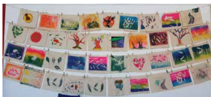
Assortment of calico bags made with stencils and acrylic paints