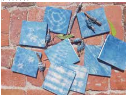
Shibori-covered concertina artist books