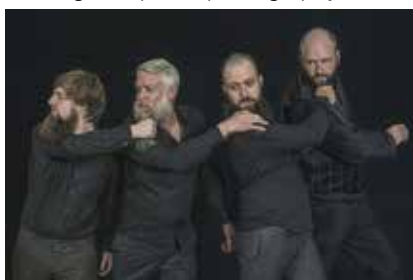
'Farandole' by Christophe Canato

This year's exhibition was special for the City as they were able to return to their newly renovated Armadale District Hall to showcase pieces across various mediums of the fine arts, including painting, drawing, printmaking, sculpture, photography and textiles.