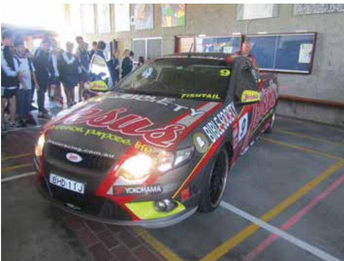
The Ford XYGT of V8 Supercars fame