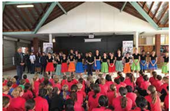
Year 7 Dancers performing 'Italian Restaurant'