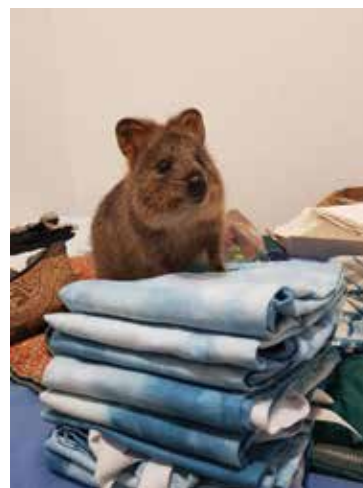
Friendly fauna getting in on the act!