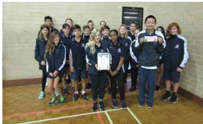
Year 7 English Students

Our Year 7 English students successfully progressed past the initial judging in the 2019 Schools' Writing Competition. This year, the competition was held throughout primary and secondary schools within Australia and over 10,000 entries were received. Balcatta SHS has been recognised for outstanding student writing with less than 10% of schools showing this level of achievement. Well done!