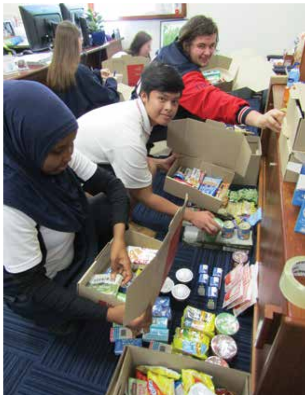
Students putting together the care packages