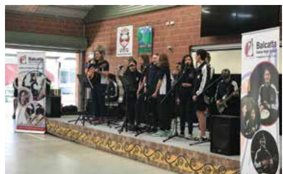
Year 8 Music students performing 'Counting Stars'