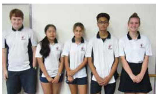
Year 10 Student Councillors