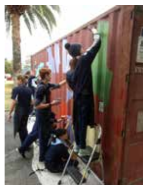
Students painting the sea container