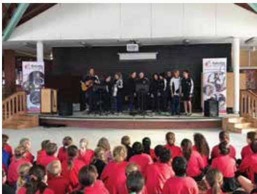
Year 8 Music Performance