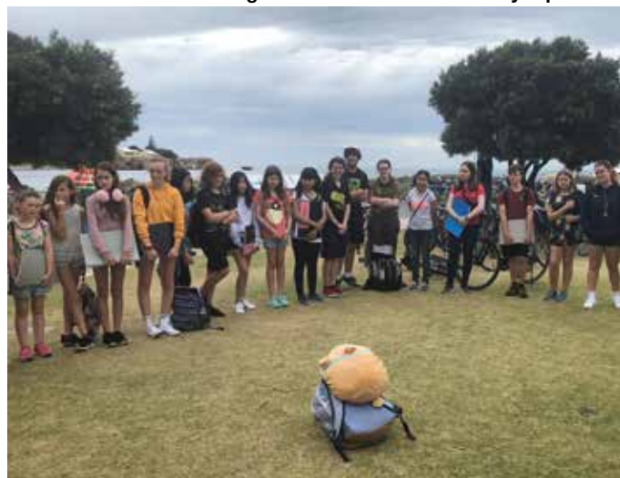
Art Students on Camp