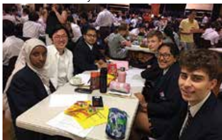
Years 11 and 12 Students