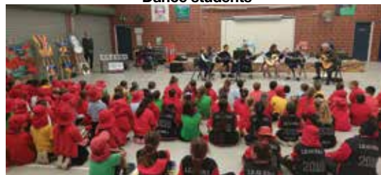
Music students performing for primary students