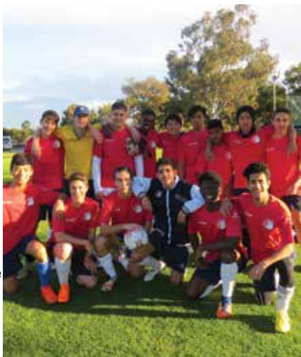
Senior Boys Soccer team