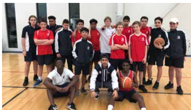
Year 9 Basketball team and coaches