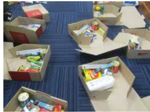
Care packages being prepared to send overseas

Thank you to all those involved in preparing the care packages and the student body for their generous donations. We hope these packages brought smiles and fond memories of home to the members of our Australian Defence Force.