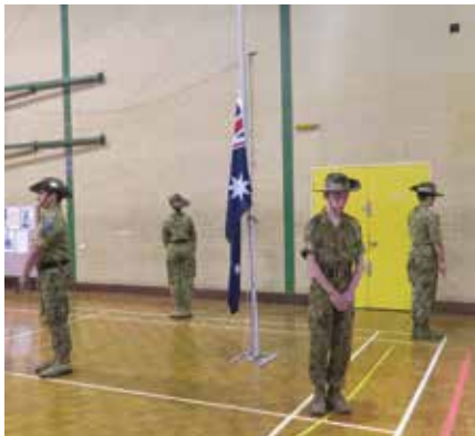
The Catafalque standing guard over the flag