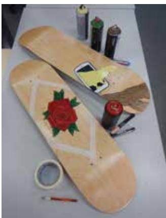
Skateboard designs in progress

This new art program at Balcatta Senior High School is engaging students with the expanding phenomenon of "Street Art", or "Urban Art", as it is more commonly being recognised. Students are having an opportunity to explore new media used by professional urban artists to express themselves through developing art skills relative to their interests and current popular culture. Projects include mural designs to be painted on the large sliding doors of most classrooms around the school, along with designing and painting their own rideable skateboard decks.