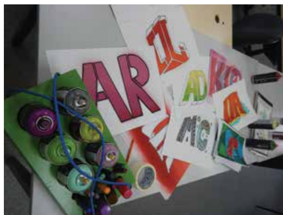
Stencil skills designs with spraypaints