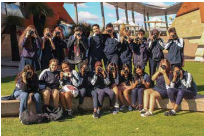
Year 9 Photography students

Year 9 Photography students attended an excursion on Friday 1 June, to capture images of the 'Urban Landscape'. Focusing on the themes, 'Utopian City', 'Urban Decay', 'Lonely City' and 'Secret City', students walked through Northbridge and Perth City. They used different viewpoints to emphasise the soaring aspects and height of buildings, took close-up shots of buildings, emphasising grids and geometric patterns, captured reflections in glass and photographed aspects of the urban environment in decay. Students are now editing their photographs, which will be printed and exhibited early next term.