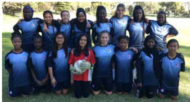
Junior Girls Soccer Team