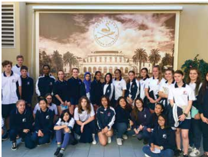
Year 10 HaSS students inside Parliament House

All the students were excellent ambassadors for our school and were engaged in learning for the duration of the day. Well done to all involved in a fantastic educational opportunity.