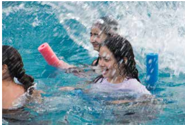
Making a splash at the Pool Party