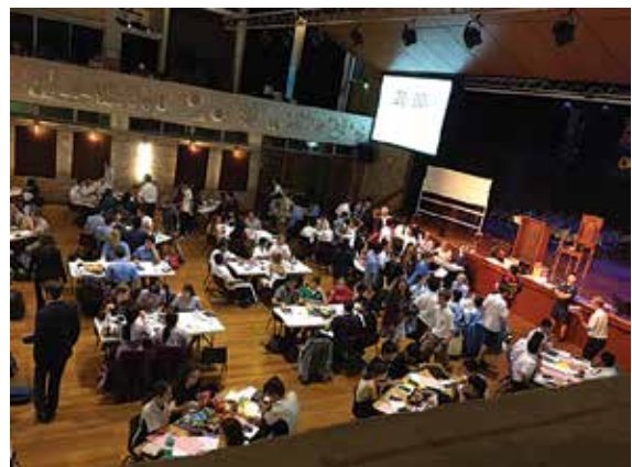
Year 11/12 teams working hard at Hale School