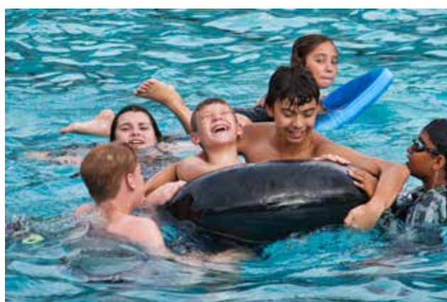
Fun in the pool