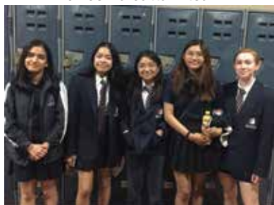
Junior Balcatta 2 team