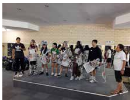
Newspaper fashion show

The day was packed with fun and engaging team-building and leadership-designed activities. The leaders had time to work through their Peer Mentor booklet which included different activities. They finished the day with a 'newspaper fashion show', in which they had five minutes to create an outfit and select a representative to model their masterpiece.