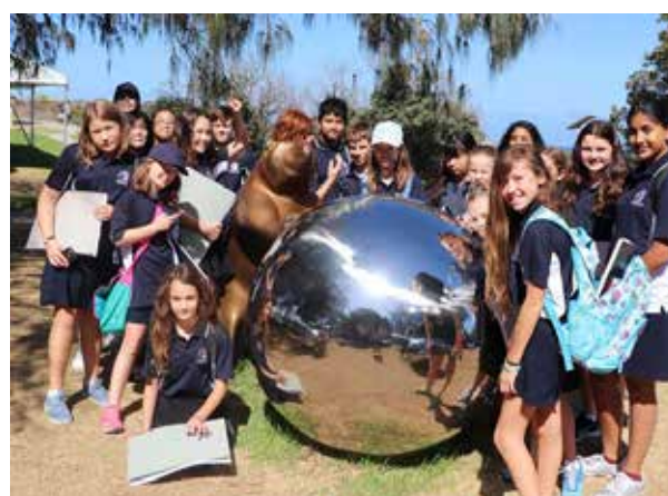
Students with sculpture titled 'Rolling the Earth'