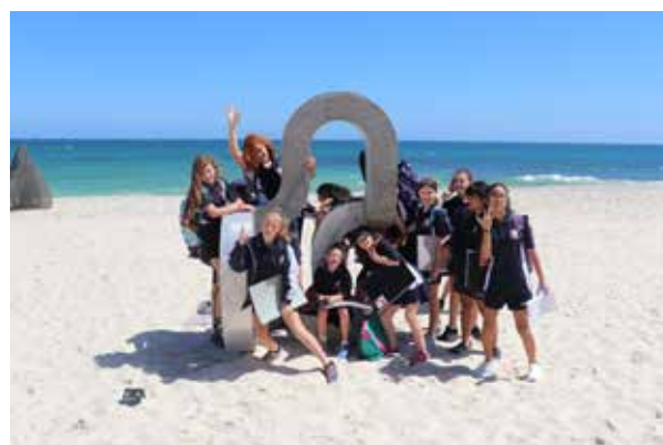
Year 7 students with sculpture titled 'Getting There'

On Wednesday 13 March, our Year 7 Gifted and Talented Visual Art students enjoyed exploring the annual outdoor sculpture exhibition, Sculpture by the Sea on Cottesloe Beach. It was a very inspiring and fun experience for students to engage with beautiful and thought-provoking art installations.