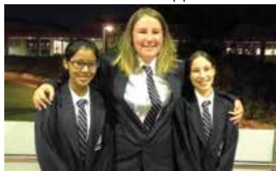
Novice Balcatta 1 team

All the students did a great job and represented the school well. For some of the students, this was their first time debating and they were so brave to stand up and give it a go. The next rounds will all be held at Hale School, Wembley between 6.00pm and 9.00pm and are scheduled on Wednesdays - 15 May, 29 May and 12 June. All staff, parents/guardians and students are welcome to attend to support our students.