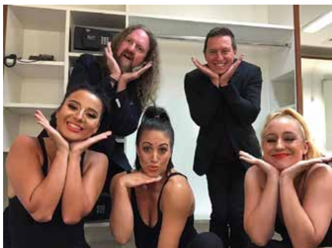
Ex-Balcatta Dance students - part of the Perth Fringe Festival