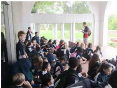
Roll call for Year 7s

Our students were treated to a unique, action-packed day with many presentations and a mixture of community groups, entertainment and sporting activities.