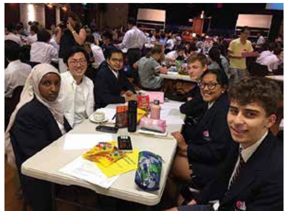
Year 11/12 Maths students