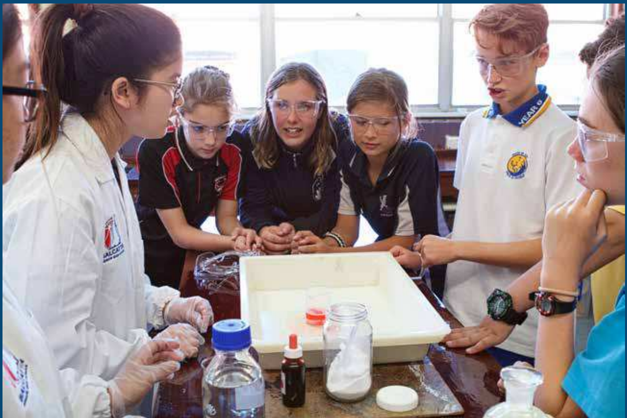
Year 9 Chemistry experts demonstrate to Year 6 students