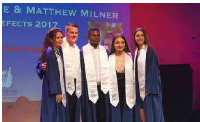
Our outgoing prefects