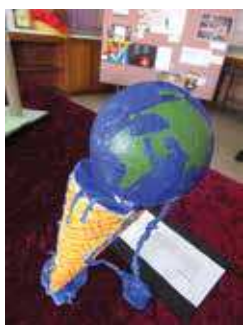
We Scream - Sasha Roob