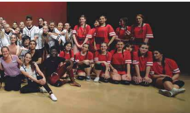
Students posed in end of year showcase 'Converge'