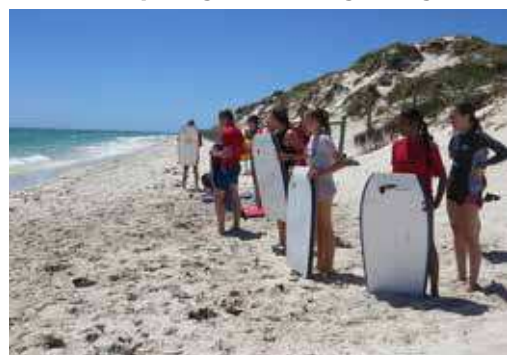
Iron Man Competition