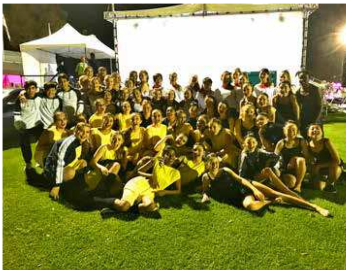
Specialist Dance Students at Osborne Park Show

Specialist Dance students from Years 7 to 10 took the stage at the Osborne Park Show in Week 6 as part of the dance finale lead up to the fireworks. The crowd was the largest we have seen in recent years, and the rain held off long enough for them to cheer and clap loudly for our students. Once again, a brilliant showcase for Balcatta Senior High School