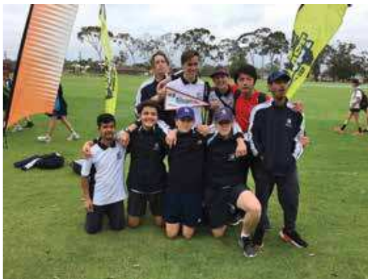
Years 9/10 Cricket Team

Much to everyone's surprise, Balcatta Senior High School has been represented in interschool cricket. Years 7/8 and Years 9/10 students made up teams to compete in the North East Region Milo T20 Blast cricket tournament. Both teams did the school proud with the Year 9/10 team winning the area competition undefeated and advanced to the state championships which were held on Friday 3 November. Although the boys were not able to win this one, they enjoyed the return to interschool competition. The boys really 'gelled' as a team to produce some excellent