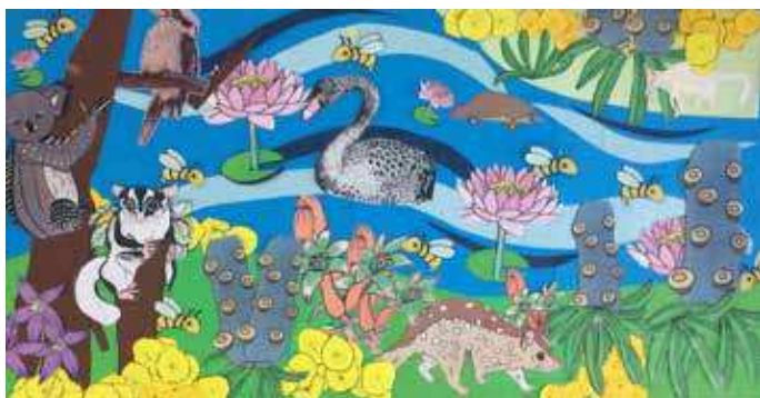
Mural designed by our Year 10 Gifted and Talented Visual Arts students

During Semester 2, Year 10 Gifted and Talented Visual Arts students designed a mural to be placed in the Pre-Primary area of West Balcatta Primary School. The students have all contributed ideas to the design process and are now busy painting large boards which will be assembled and attached to the building facing the Pre-Primary play area. We look forward to seeing this in place before the end of the term.