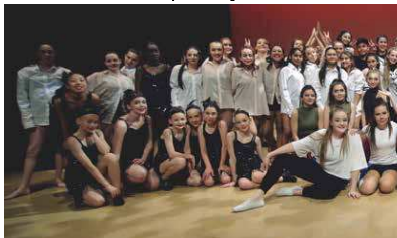
Specialist Dance students who perform