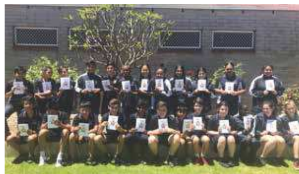
Year 7 English class