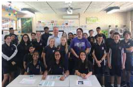
Year 8 English class