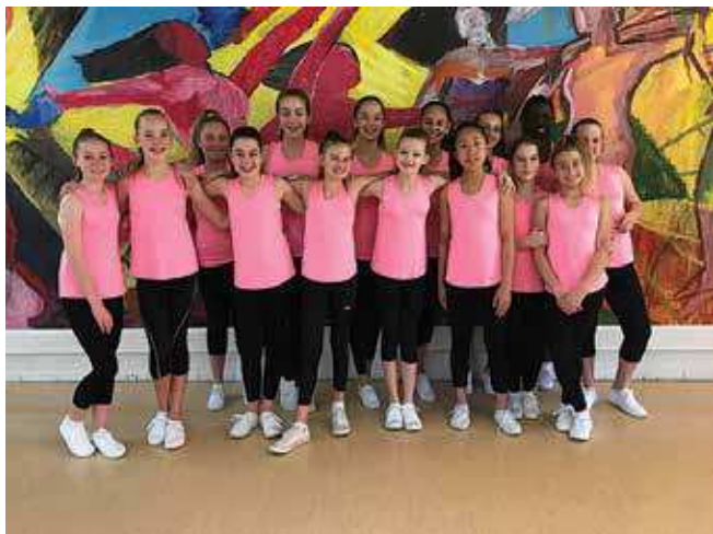
Year 7 Dance Students

Our Year 7 Dance students made successful visits to both West Balcatta Primary School and Takari Primary School this term. They performed one of their pieces from the End of Year Dance Showcase, and it was fantastic for some of the students to return to their former Primary School to strut their stuff.