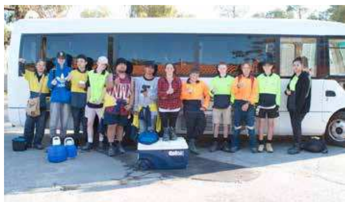
Try-A-Trade students ready to go

During Term 3 & 4, some of our Years 9 and 10 students participated in a three-day Skill Hire Try-A-Trade Program at their Forrestfield Training Facility. The students were introduced to the wood and brick trades enabling them the opportunity to experience hands-on activities and explore different aspects in these areas. The feedback was extremely positive with students feeling fulfilled and excited to have been involved. The students received a Certificate of Participation from Skill Hire.