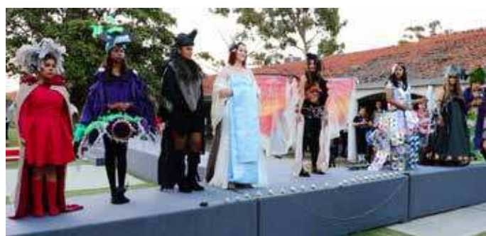
Students modelling their Wearable Art