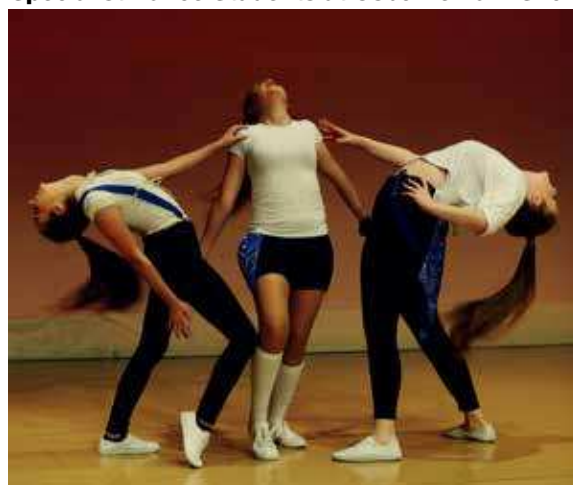
Year 12 students performing 'Circus'