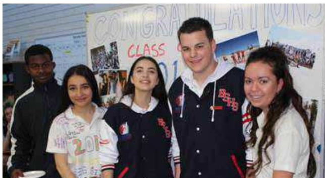
Year 12 Prefects say 'Goodbye'