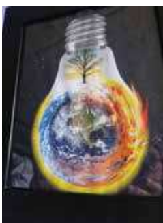
Switch off - Fromi Mohammed