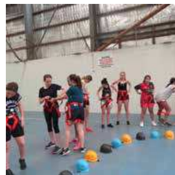
Preparing for 'The Big Swing'

Perhaps the hardest challenge for some students was the long ride back to school in the heat of the day, knowing that they had to climb up the huge hill on North Beach Road. There were no complaints and they returned to school safely, three minutes ahead of schedule.