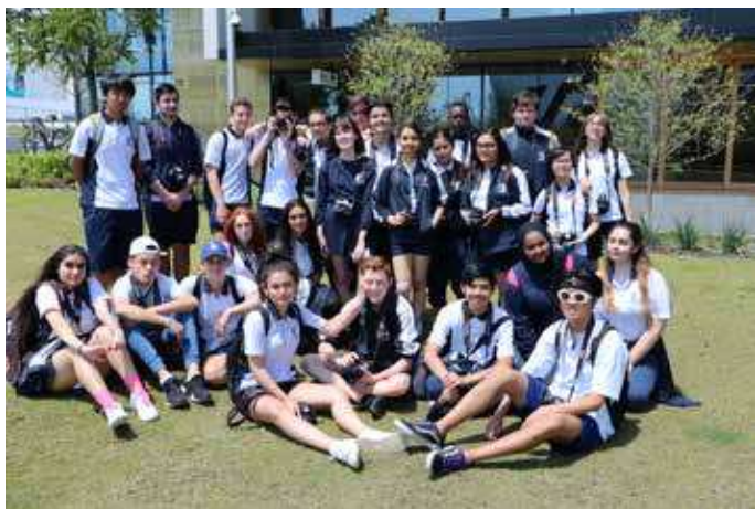
Year 10 Photography group

The Year 10 Photography classes have been working on an Urban Landscape assessment. On Thursday 2 November and Friday 3 November, they ventured into Northbridge and Perth City to create a series of images within the medium of 'Urban Landscape'. Using the themes of 'Utopian City', 'Urban Decay', 'Secret City' and 'Lonely City', they were tasked with capturing close-ups of buildings emphasising grids and lines as symbols of modernism, look at the geometry of buildings, the structural elements of the architecture, doorways, windows and geometric patterns. They took photographs of reflections in glass, the city environment, the sky, trees, other buildings or even themselves as the photographer taking the shot. They were also tasked with capturing images of the city that expressed a feeling of decay; for example, factories, abandoned/old buildings and graffiti. After the excursion, students returned to school and prepared their images. They used Photoshop to edit and make adjustments to reflect and emphasise the theme of their photographs by cropping, changing exposure and contrast, manipulating hue and saturation, and applying filters or effects to their images.