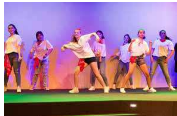
Year 10 Dance students performing 'So Excited'