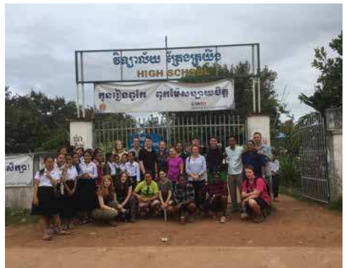
Our sister school Treng Trayung High School