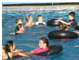
Having fun in the pool