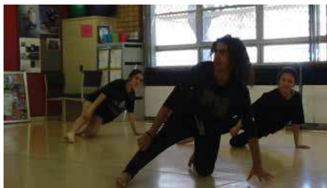
Performing section of repertoire

The workshops were a fantastic opportunity for our students to learn techniques first-hand from professional dance artists.