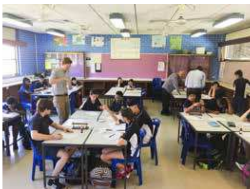
Students involved in group studies

We hope they enjoy their time at Balcatta SHS and look forward to working with them in the future.