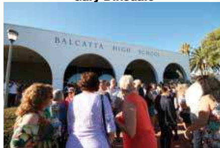
Back where it all started