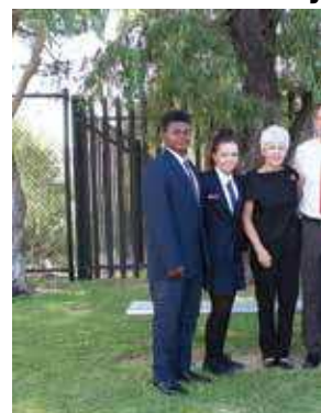
50 years on