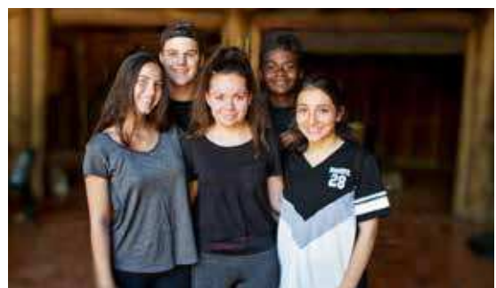
On location at Nanga Bush Camp