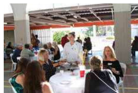
Our Hospitality students at work