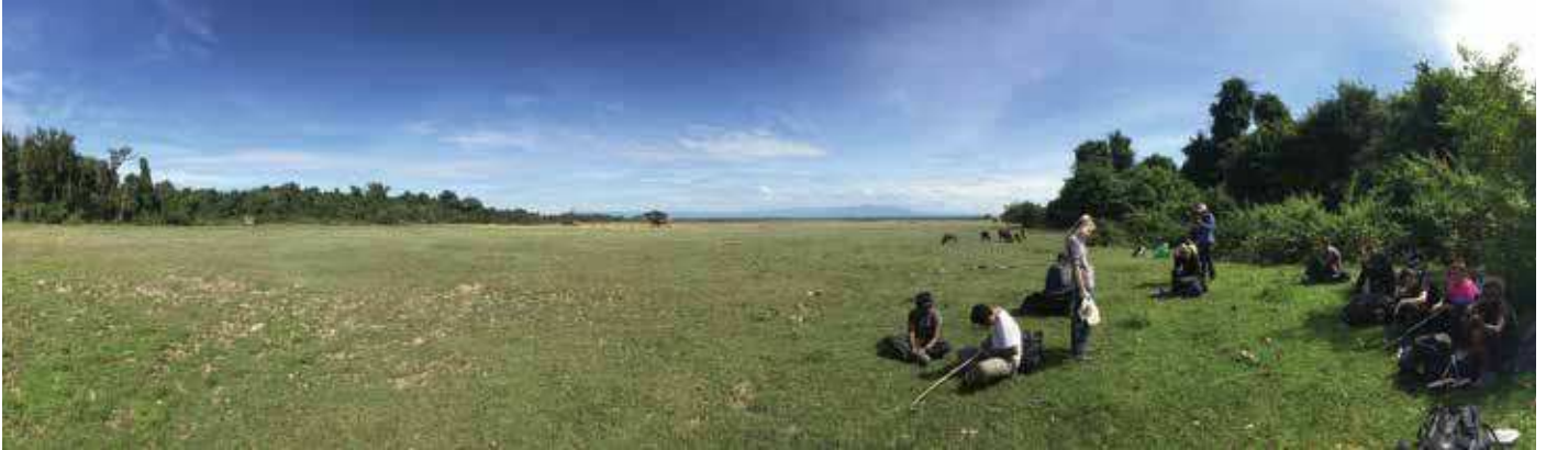
The welcome end of a long hard trek

The 2016 Balcatta Senior High School World Challenge saw seven Balcatta students teaming up with seven students from St. Patrick's College in Townsville, Queensland and venturing through the South East Asian countries of Laos and Cambodia. This three week student-led expedition not only gives students the opportunity to broaden their travel horizons but helps develop leadership, resilience, compassion and a global conscience for the young people who choose to experience it.