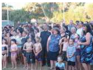
Year 7&8 Pool Party