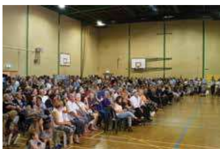
Standing room only