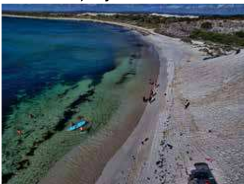
Sandy Cape Recreational Park