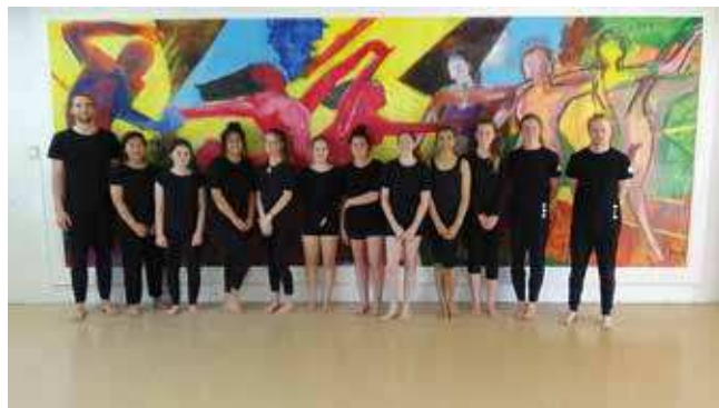
Our Specialist Dance students with host dancers