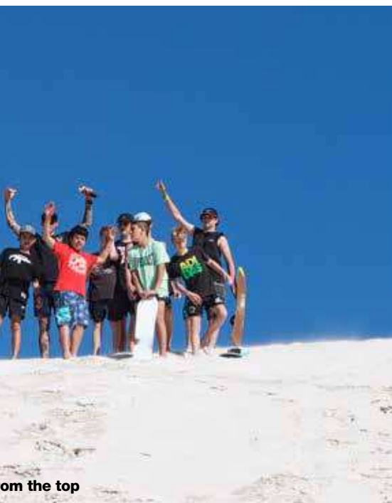
om the top