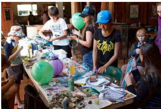
Students displaying their creative talents