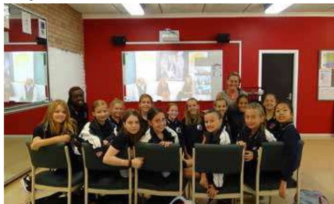
Year 7 Dance students taking part in web linkup