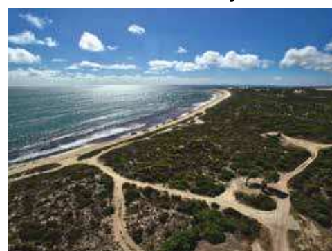
Fun at the beach

window open resulting in some rain coming into their tent and interrupting their slumbers. Next morning saw a bit of a clean-up and mopping up of puddles!