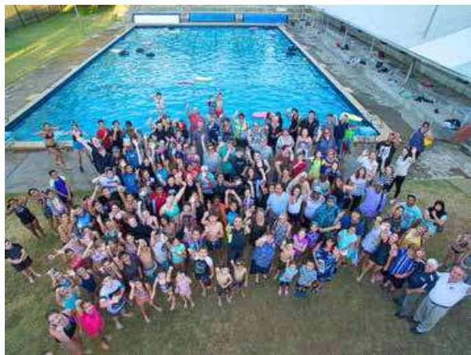
Our Year 7/8 community enjoying the evening

Enjoying free pizza or a sausage sizzle, staff and parents took the opportunity to meet and mingle in an informal way. These activities have been a wonderful opportunity to showcase the school, particularly to new parents and students. We thank all staff for their attendance and organisation, and all parents and students who took up the opportunity to attend.