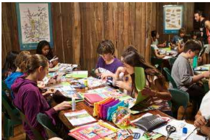
Colourful evening activities