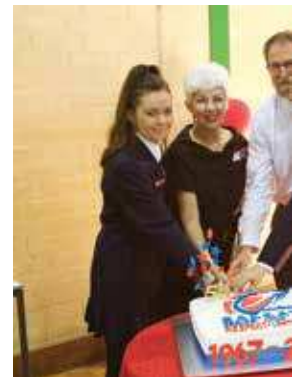
Cutting the cake