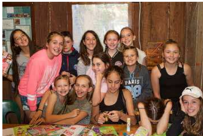
Time out for a group smile