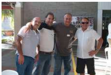
Happy to be here