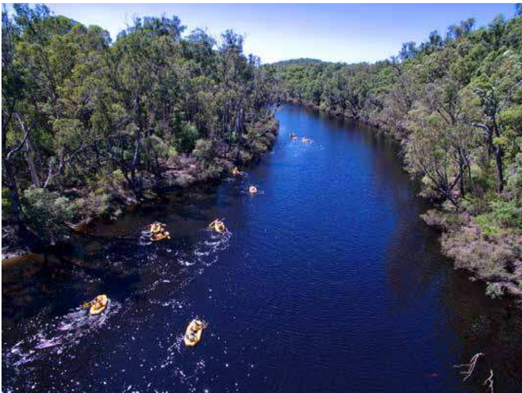
Rafting down the Murray River

"Camp was an unforgettable experience and I adored my time at Nanga. The first walk we took was just beautiful. I would do it again. The swim was so relaxing. I could just swim and relax by the sparkling river. I loved soaring through the air on the rope and flying into the cool water."