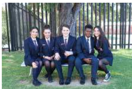
Our 2017 Prefects