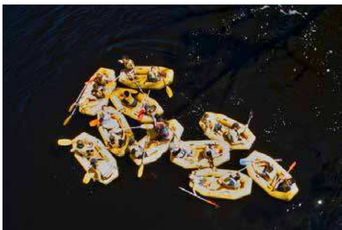
A team meeting in mid river