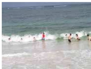
A morning swim