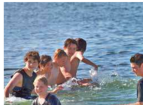
Fun at the beach