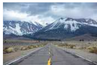
Travelled the world