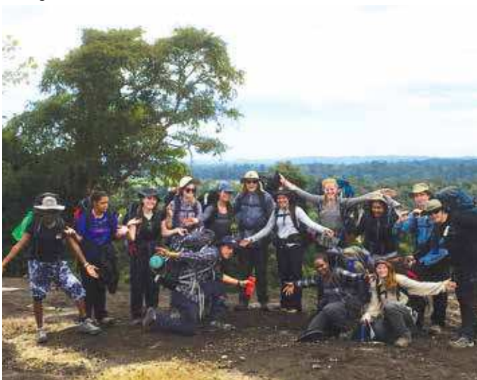
Start of trek