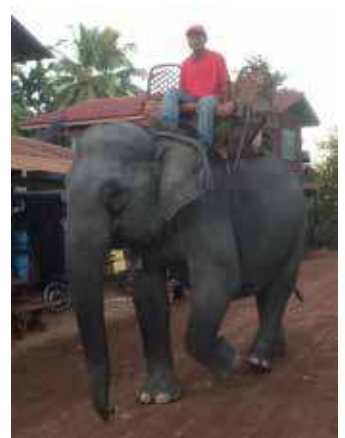
Overnight stay in village