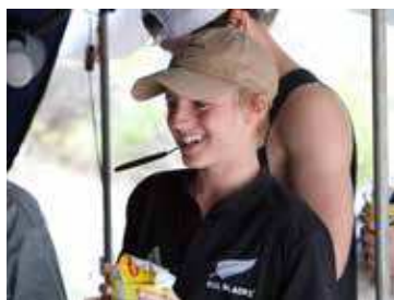
Zep is happy about lunch