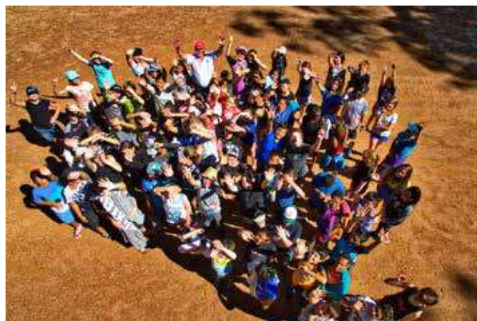
Year 7 Nanga 2017