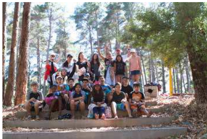
We've been rafting - it was fun!