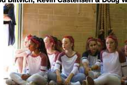
Year 9 Dance girls ready to perform