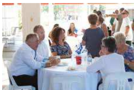
Smiles at catching up