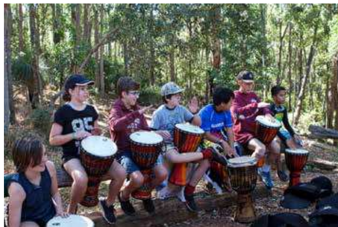
Forest drum beats