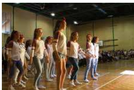
Year 9 Dance