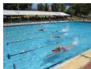
Striving for the finish line