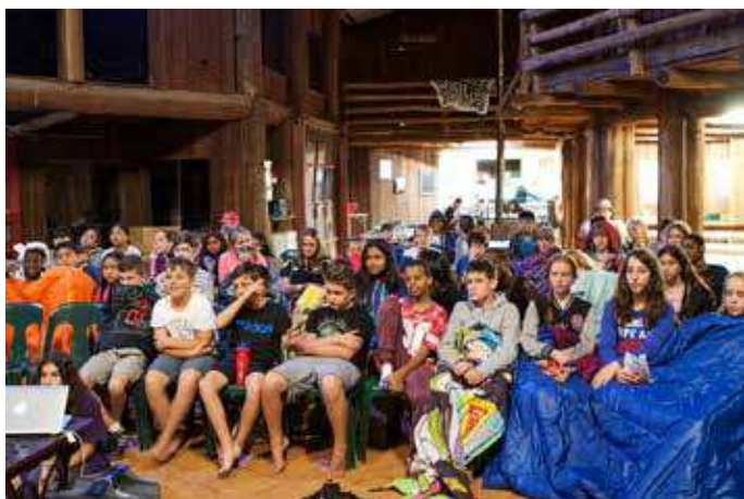
End of a busy day - movie time