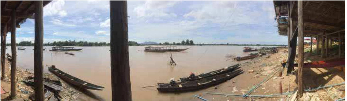
Si Phan Don