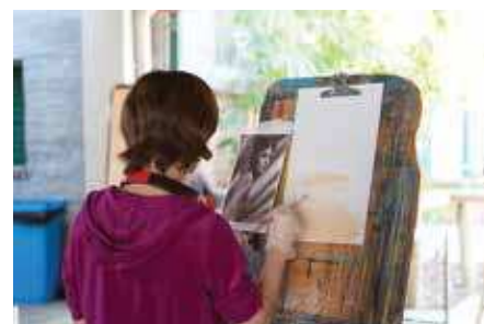
Artist at work