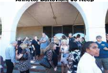
Getting ready for the group photo