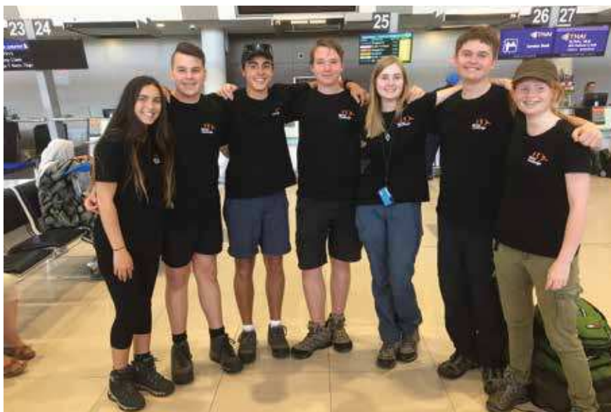
Airport smiles as we set off

With three weeks of amazing and life-changing experiences in our minds, we spent the last afternoon enjoying local food, laughing and sharing reflections of our journey on the banks of the Mekong River.