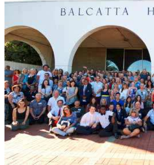
Past staff and students