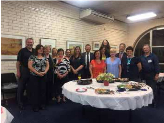
Christmas thank you for school volunteers

On Wednesday 30 November the School Council met for the last time. When the group next meets on 22 February 2017 it will be their first meeting as an Independent Public School (IPS) Board. Already this year we have experienced the benefits of IPS status as all our staffing for 2017 has been conducted utilising the flexibilities afforded by our new IPS status. This has meant we have been able to select our staff to match our school context and specific requirements. In 2017 we will welcome new staff members in Science, Mathematics, English, Humanities and Social Science and Physical Education.