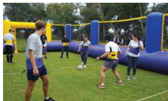
Students enjoying Foosball