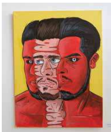
An example of Kody Mason's work