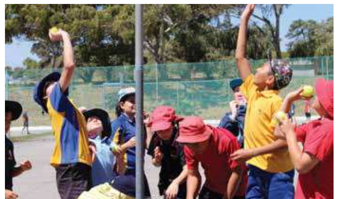
Transition Day fun