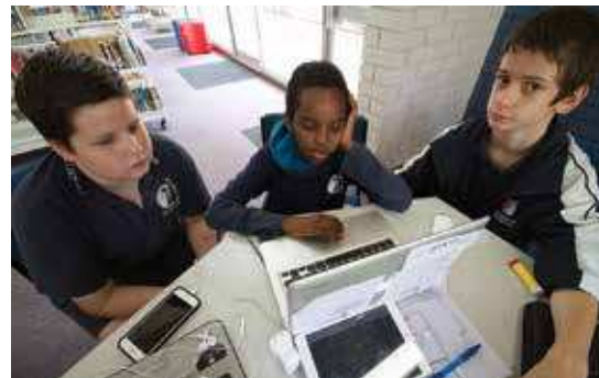
Solving the water problems

A very big thank you goes to all the staff and students who gave their time and creative energy to be a part of this very successful, collaborative project. We hope this event will become an annual event.