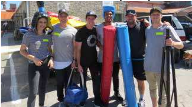
The Victory Life team

Most recently, at lunch-time on Friday 17 November, the team ran 'minute to win it' games and brought 'sumo suits' and 'gladiator duel' inflatable games for the students to use. The event was attended and enjoyed by all year groups. We are very thankful for the assistance the Victory Life team provides to the school and look forward to welcoming them again in 2017.