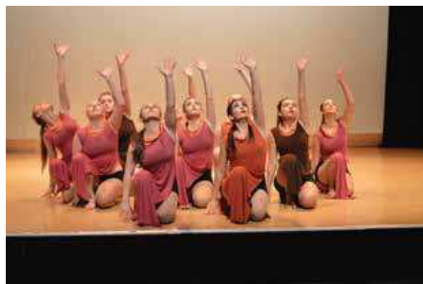
Year 11 and 12 students performing I Don't Feel Alone