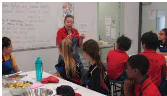
Year 6 students in Home Economics