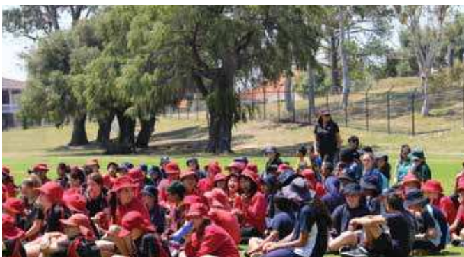
Year 6 students preparing for team games