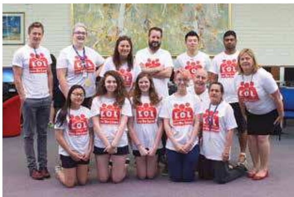
Staff and intern team ready for work