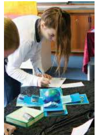
Year 10 Science Global Issues Creations