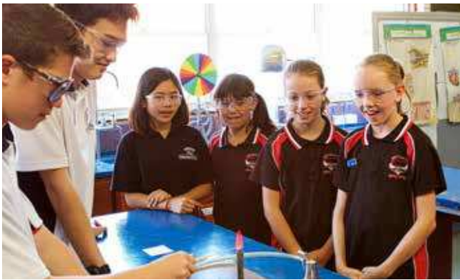
Year 10 students teach a Chemistry lesson

The students all agreed that it had been an exciting and informative introduction to life at high school. We look forward to welcoming the students back as fully fledged Balcatta students in February 2017.