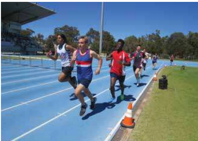
Athletes in action