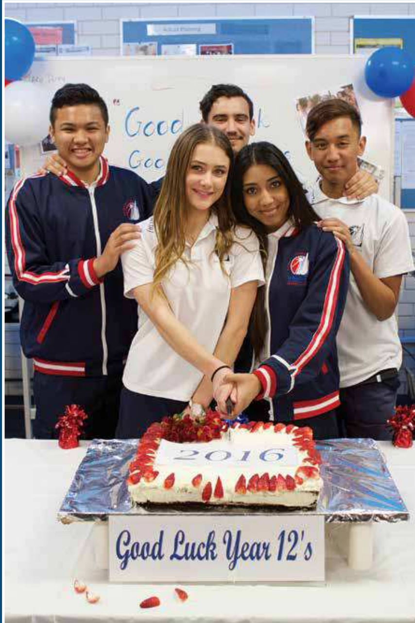
Our outgoing prefects at their farewell morning tea