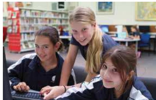
A happy team at work