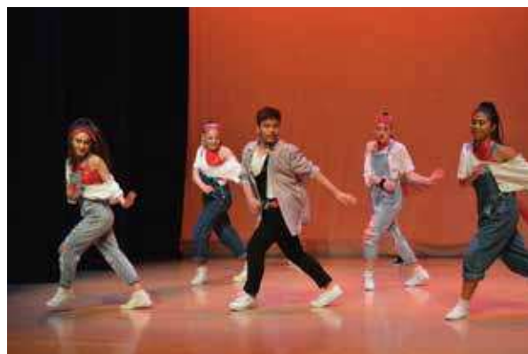
Year 10 students performing Flashback Friday