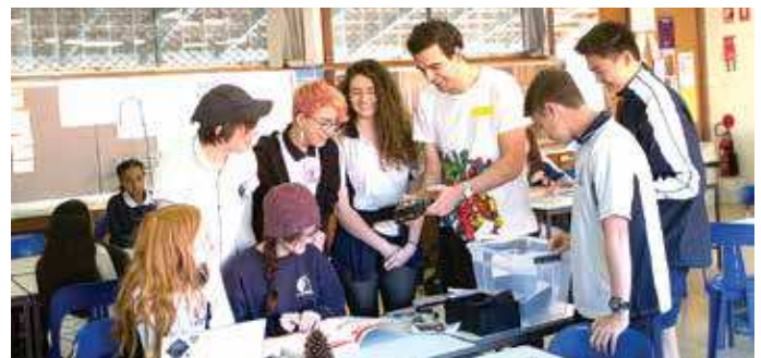
Studying the principles of drone design

With the assistance of an engineering specialist, the group had the opportunity to apply physics principles to the design of a flyable drone. They learnt about aeronautical science and were able to apply scientific knowledge to an area useful to humanity. The students enjoyed the opportunity to focus on how engineering and applied science contribute to society.