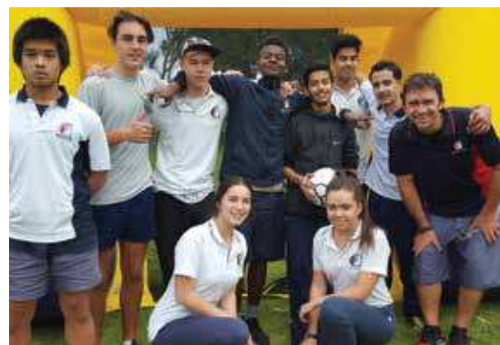
Student Foosball team

Year 10 students have again participated in the Teen Mental Health First Aid program that ran over three weeks during the latter part of Term 3. The purpose of the program was to equip students with the skills to help themselves or others when a mental health crisis arises. The program was facilitated by School Psychologists from the North Metropolitan Regional Education Office. Students were actively involved in the program and the feedback has been extremely positive. Given the rise in mental health related issues in the wider community we hope to continue with this very worthwhile program in the future.