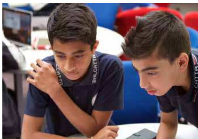
Year 7s hard at work on the Rich Task